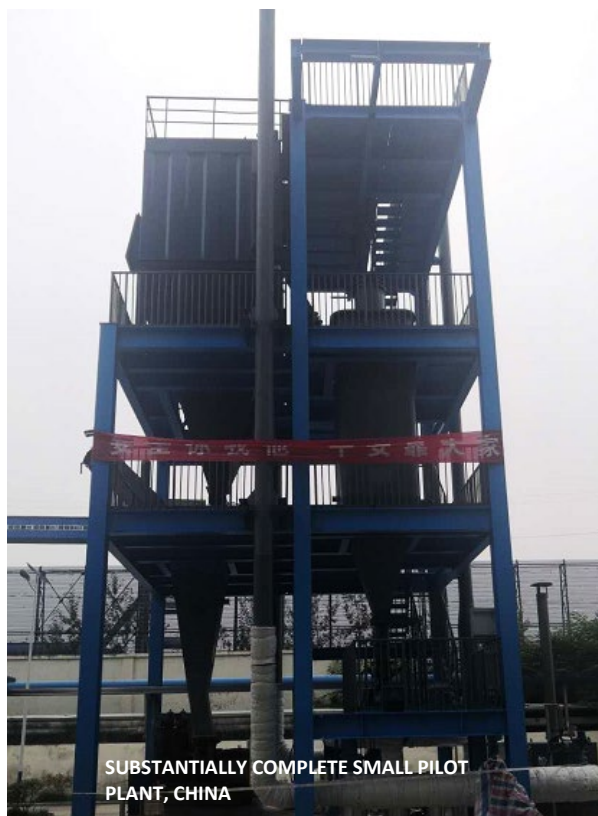
SUBSTANTIALLY COMPLETE SMALL PILOT PLANT, CHINA

Yankuang Group have constructed a small pilot plant in Shandong Province using WEC's patented BCB technology, and this is the first step in commercialisation of the technology in China. It is planned to test several Chinese coals in this plant over the coming months. Design of a 200,000 tonnes per annum BCB plant for a mine site in Shanxi Province is well advanced, and a contract for construction of the plant, that is funded by the customer, will be under White Energy's design and engineering supervision. The travel restrictions imposed by the Australian Government due to COVID-19 has slowed the contractual discussions and the ability of WEC Engineers to visit the various sites in China.