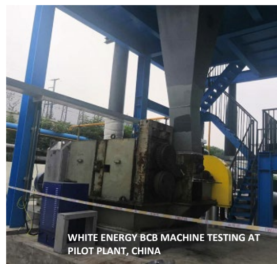
WHITE ENERGY BCB MACHINE TESTING AT PILOT PLANT, CHINA