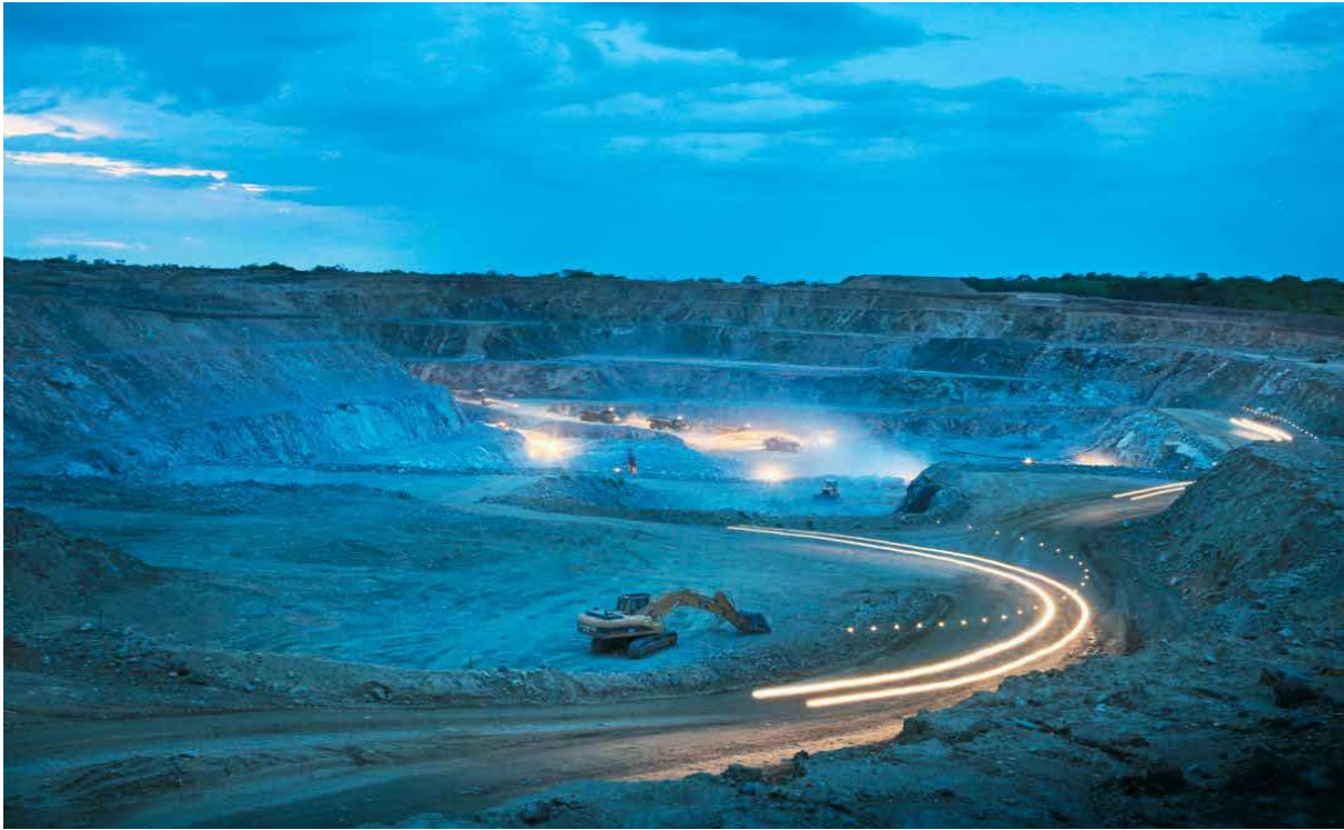
Figure 3: Digmin contract mining at New Luika Gold Mine, Tanzania