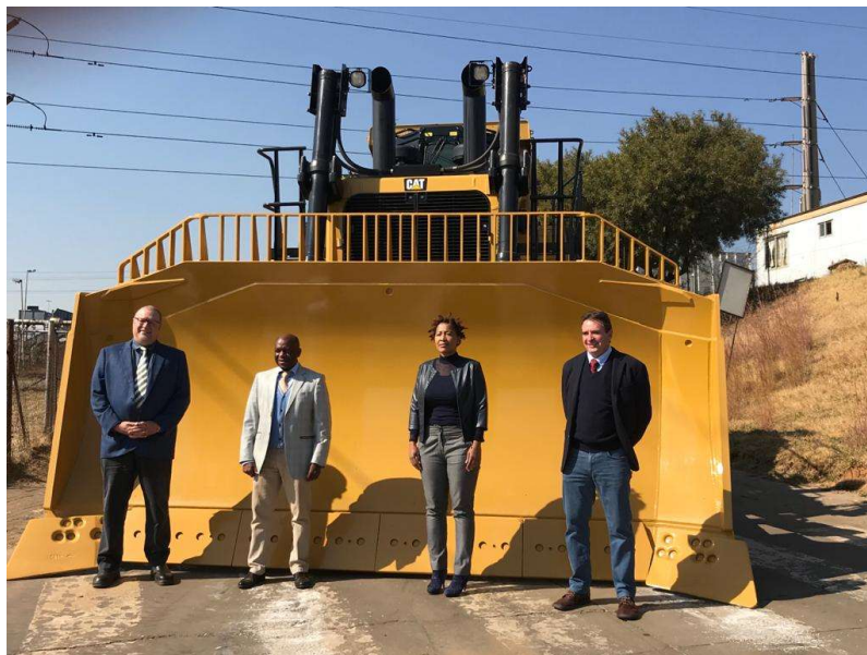
Figure 2: TGME and Digmin Directors at Barlows-Caterpillar Equipment Johannesburg

Digmin have also agreed to partner with Theta Gold to facilitate local employment and social upliftment programs in the small Pilgrim's Rest community. Residents have been eagerly awaiting this progress towards an official start of construction and mining in the area.