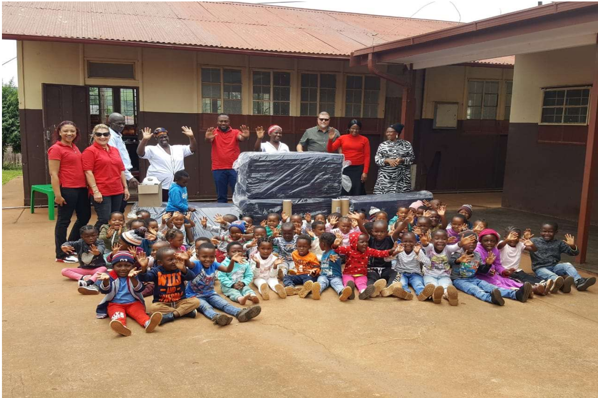
Figure 5: Company Staff (in red) and TGME CEO George Jenkins (grey shirt) at the local school