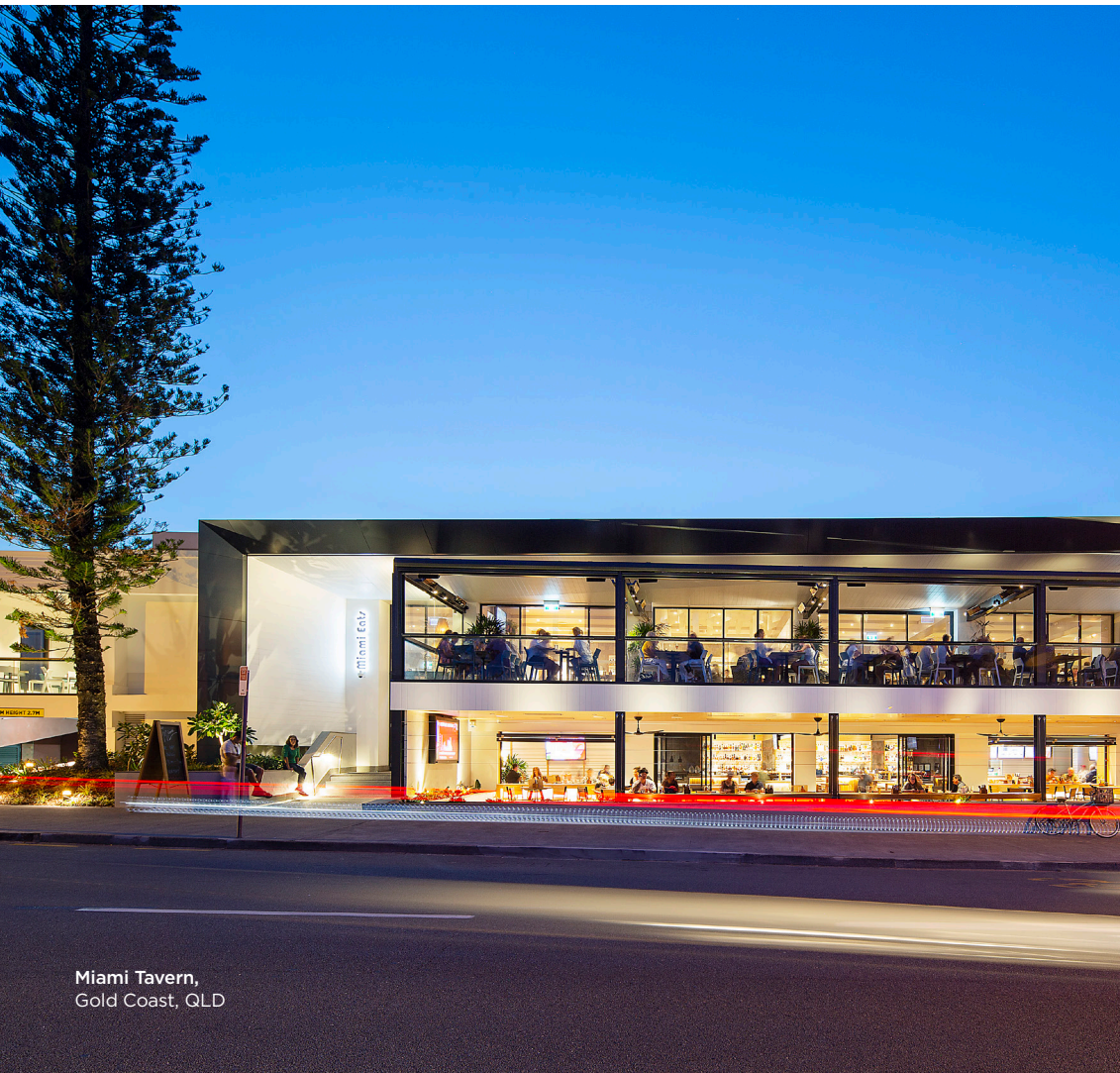
Miami Tavern, Gold Coast, QLD