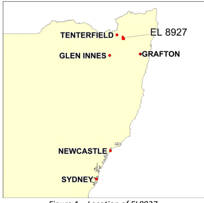
Figure 1 – Location of EL8927.

The Hortons gold tenement (EL8927) is situated 30km of Tenterfield in Northern NSW (see Figure 1) and has high potential for Intrusion-Related Gold System ("IRGS") type gold mineralization. The tenement covers 58 sq. km and has a number of gold targets, of which some have historic drilling (see Figure 2).