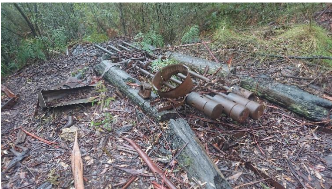
Fig (1): Maid of the Mountain

Following a program of regional site visits and a detailed assessment of prospectivity led by the group's Geology team, the Company's Board and Management reached a unanimous view that the exploration upside represented by the Company's tenement portfolio was too significant to dilute.