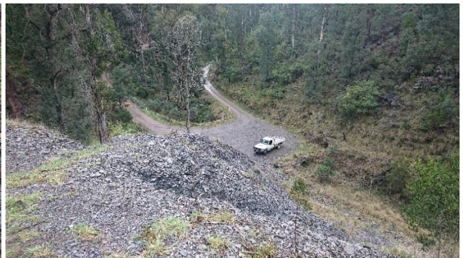
Fig (2): Toombon

This region of Victoria, the Walhalla-Woods Point goldfields has produced more than 6Moz Au. Within this belt, the company holds a tenure position of approximately 670km 2 with historical production of 1.7Moz Au.