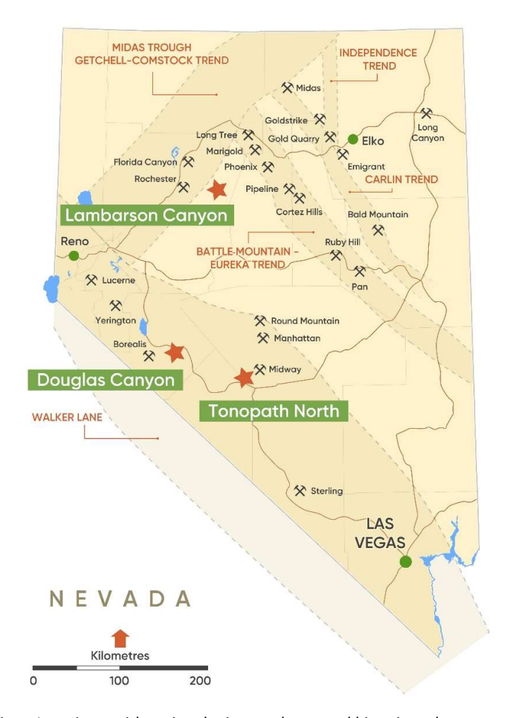
Figure 2: Nevada Projects Locations, with regional mines and reported historic and current resources & reserves<sup>2</sup>

The planned drilling campaign may comprise up to five diamond drill-holes at the Lambarson Canyon Project that will focus on testing gold targets, where initial field work has identified high-grade outcropping gold mineralisation which returned a channel sample of 3m @ 6.97g/t Au <sup>1</sup>, and an individual rock-chip/float sample which returned 61.6 g/t Au <sup>1</sup> (Figure 3), along with a strong coincident IP resistivity and conductivity anomaly to the south of the outcropping mineralisation (Figure 4).