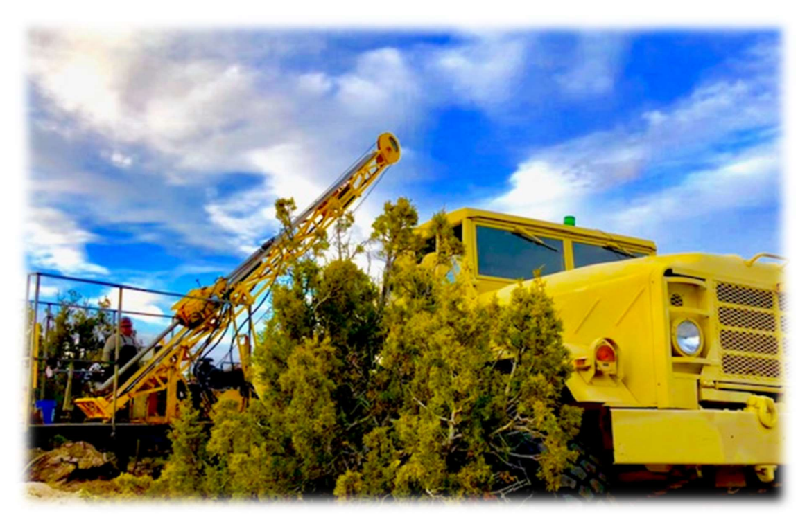
Figure 1: Drillrite LLC Atlas Copco Diamond Drill rig on site in Nevada