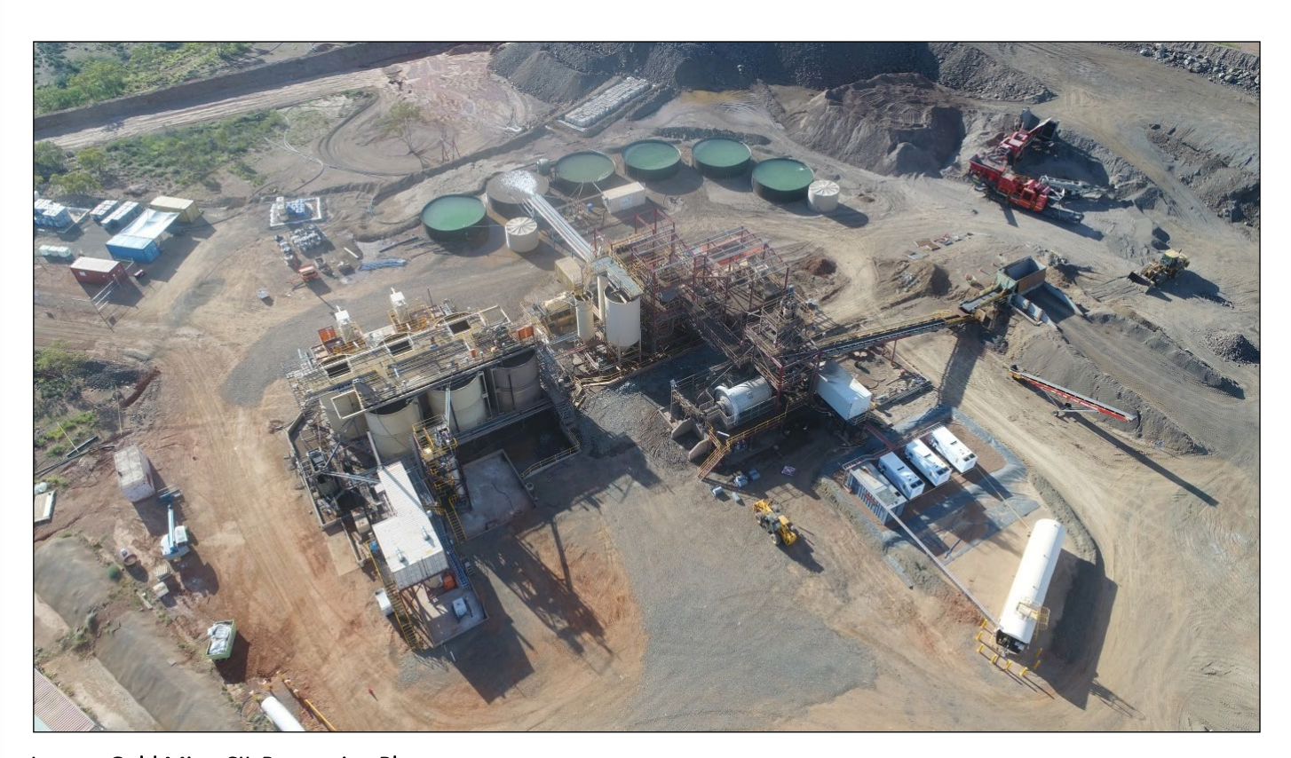
Lorena Gold Mine CIL Processing Plant

Whilst the agreement entered into with Lorena Gold Mine will allow for the subsequent batch of ore in this mining campaign to also be processed through their plant, Laneway is continuing to progress other processing plant options which may be utilised longer term for the processing of high grade ore from Agate Creek including for the second batch of ore from this mining campaign.