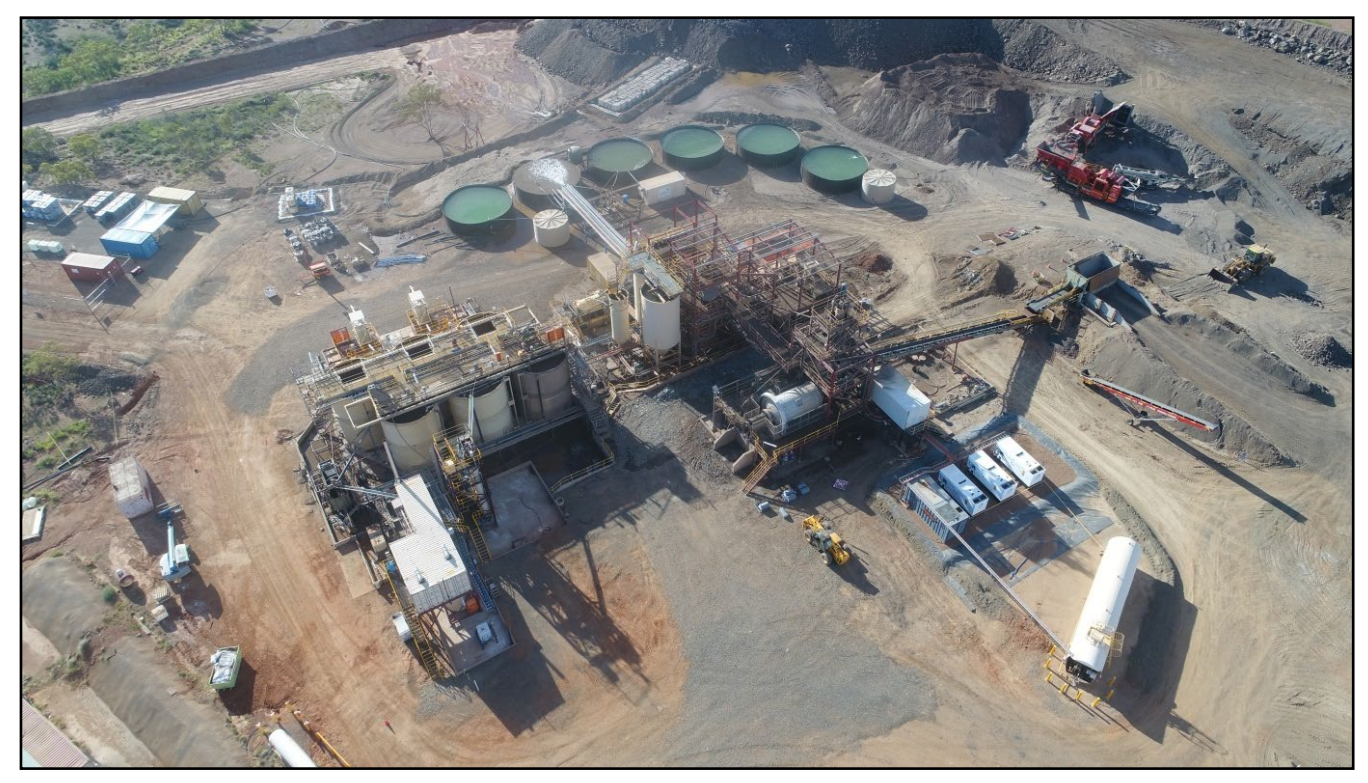
Lorena Gold Mine CIL Processing Plant

Whilst the agreement entered into with Lorena Gold Mine will allow for the subsequent batch of ore in this mining campaign to also be processed through their plant, Laneway is continuing to progress other processing plant options which may be utilised longer term for the processing of high grade ore from Agate Creek including for the second batch of ore from this mining campaign.