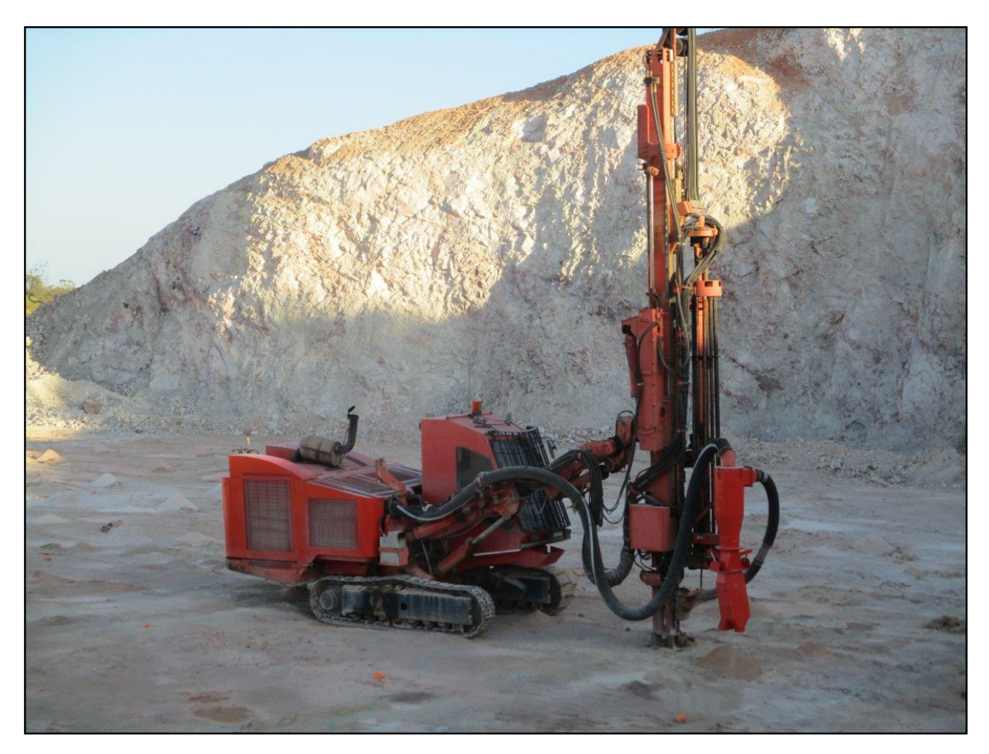
Blast hole drilling in preparation for initial blast – 16/10/2020

Blast Hole drilling has commenced in the pit area with the initial blast planned for next week. The mining contractor, Maas Group, is currently mobilising the mining fleet with some plant now on site with the balance scheduled to arrive in the coming days.