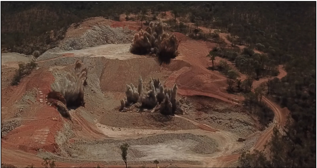
Figure 1: First blast in current mining campaign – 22 October 2020