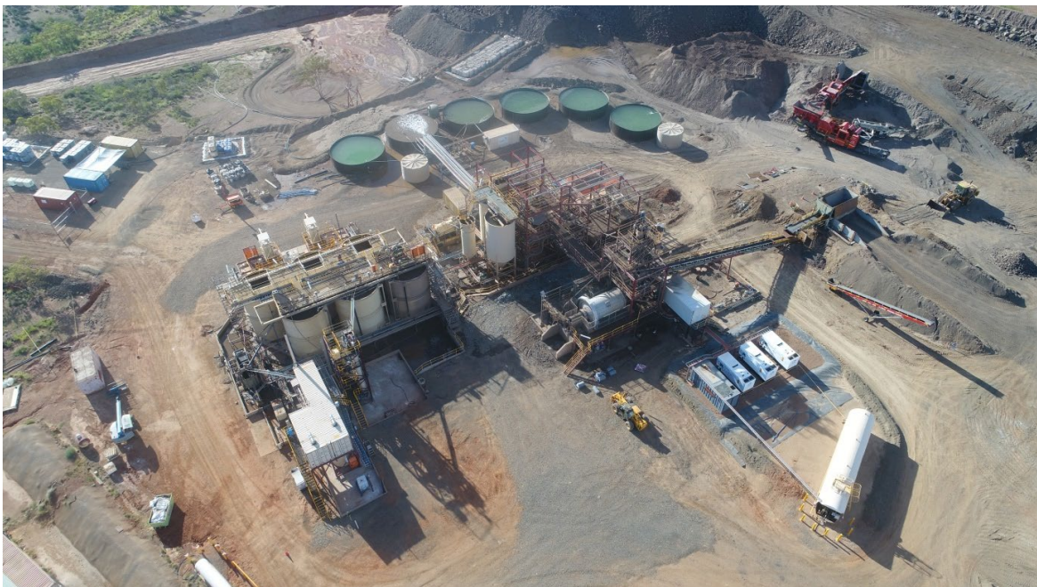
Figure 4 - Lorena Gold Mine CIL Processing Plant

Whilst the agreement entered into with Lorena Gold Mine will allow for the subsequent batch of ore in this mining campaign to also be processed through their plant, Laneway is continuing to progress other processing plant options which may be utilised longer term for the processing of high grade ore from Agate Creek, including for the second batch of ore from this mining campaign.