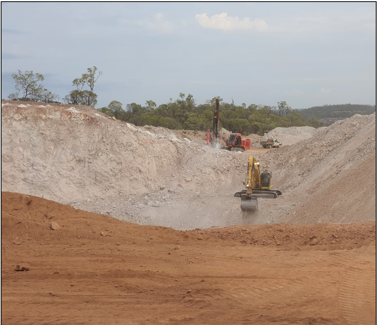
Figure 2: Mining underway – 23 October 2020