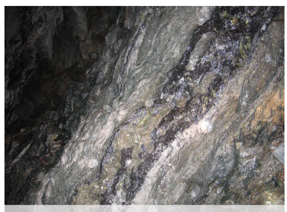
Example of 'visual' high grade mineralisation encountered during mining operations at Warrior

The frequency of larger high-grade areas may follow somewhat of a 'repetition' or pattern with study continued during the quarter.