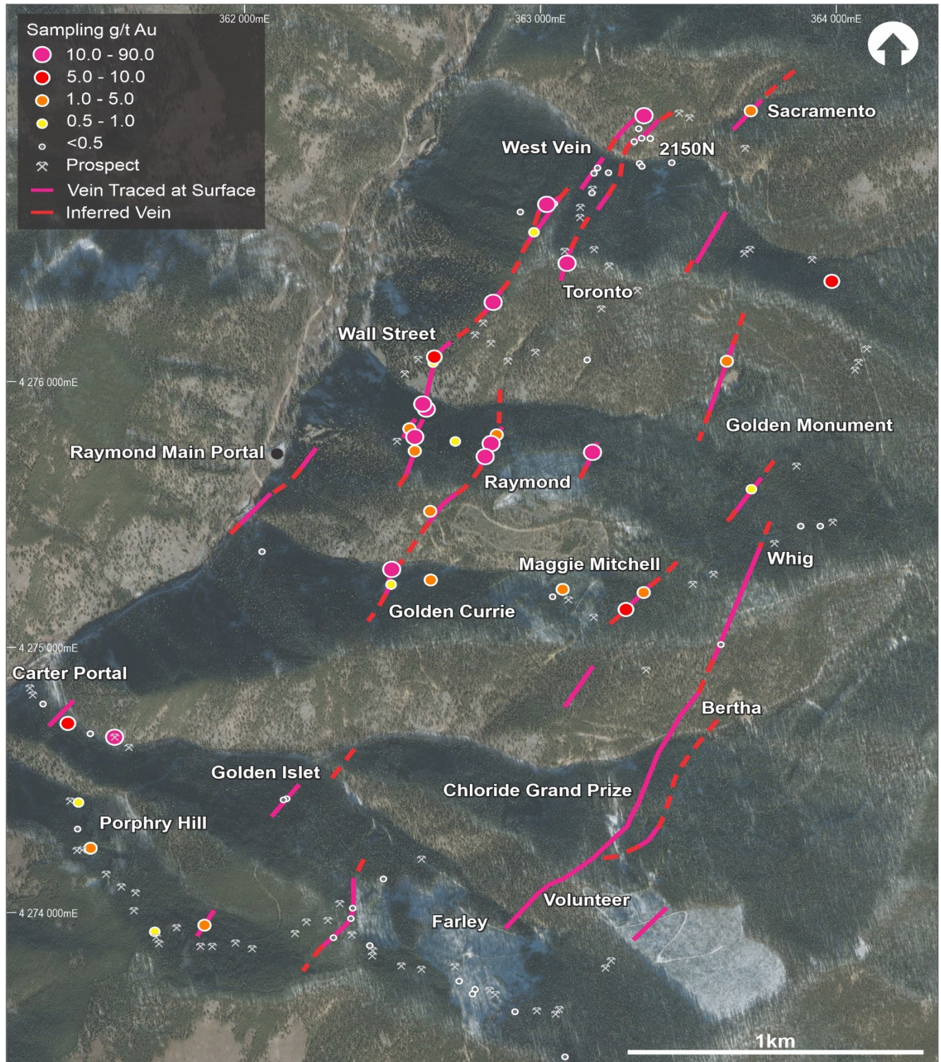
Figure 1: Plan view of Gold Links project

The mapping has identified several drill targets that will be followed up either by drilling from underground or from the surface. The priority targets are the Wall Street-West vein and the South side of the 2150 vein towards the Toronto shaft