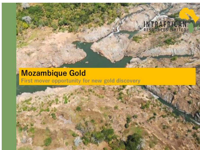
Photo of the potential 'Muteger' gold trap in the Lurio River subject to exploration and dredging development

IEC has entered into an Investment Agreement with Intra Minerals Ltd (IML) to buy an additional 30% of shares in the company for the investment of US$1.3m with the option to purchase up to 15% additional shares. IML has also engaged an operations consultant with "hands-on" experience in establishing gold mining operations in Southern Africa in conditions similar to the Minas Do Lurio project. IEC has mandated Bellhouse Capital PLC, an UK-based Financial Advisor to prepare a Presentation and advise on the capital raising route for IRL.