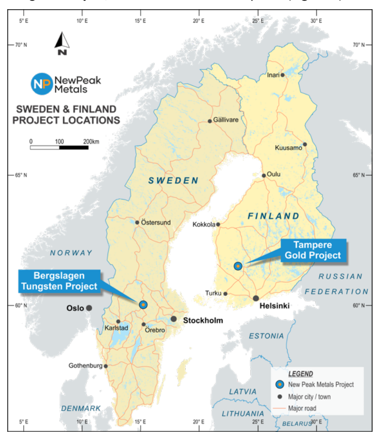
Figure 3: Location of the Finland Tampere Gold and Sweden Bergslagen Tungsten Exploration Permits in northern Europe.

The Company entered into Permit Purchase Agreements with Sotkamo Silver AB to acquire 100% of the interest in a number of highly prospective Gold exploration permits in Finland, the Tampere Gold Project. Sotkamo's portfolio also included a group of Tungsten Exploration Permits in Sweden, the Bergslagen Tungsten Project, which NewPeak also acquired (Figure 3).