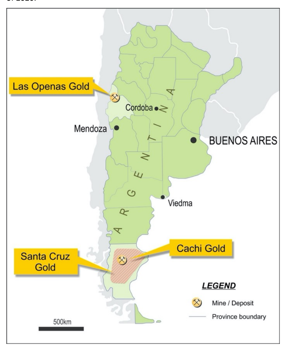
Figure 2: Location of the Argentine Gold Projects.

Extensive mapping, ground magnetics, Induced Polarisation (IP) and rock-chip sampling programs have been completed at the Cachi property. Fifteen (15) large mineralised targets have been identified, the five main ones being Vetas Cachi, Morena, Vetas NW, Patricia and Puma. Vetas Cachi and Vetas NW are the highest priority targets as they are large, well exposed at surface and have the highest-grade rock chip and trenching Gold and Silver assays. Numerous anomalous Gold and Silver rock chip and trench samples, with individual surface sampling results up to 17.8 g/t Gold, have been previously reported by the Company. These two targets will be tested in the upcoming drilling program planned to commence in the last quarter of 2020.