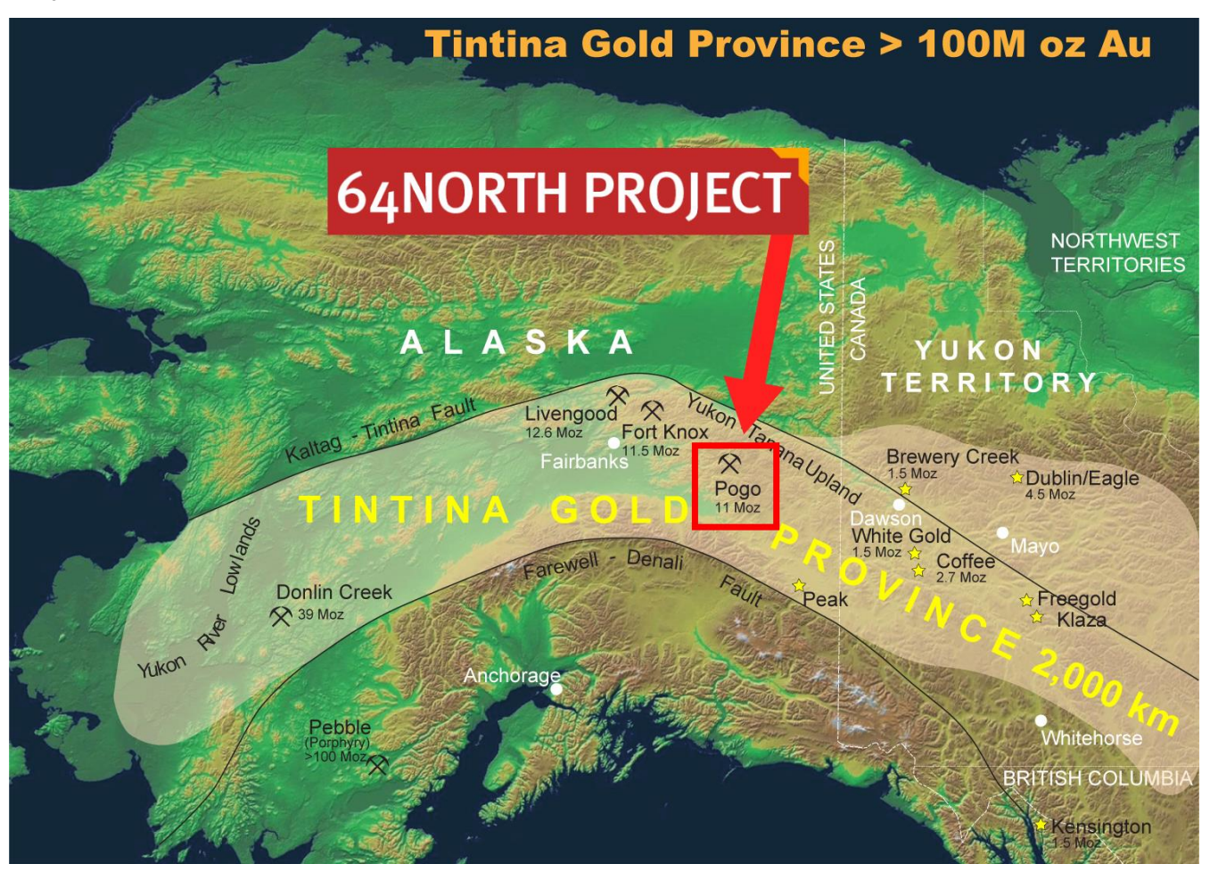
Figure 3 Deposit sizes stated as Endowment (Resources & Reserves + Historic Production) *sourced from Company websites

"We look forward to the results of these high priority holes with great anticipation and to completing our preliminary evaluation of the West Pogo Block in the first season of the 64North Project."