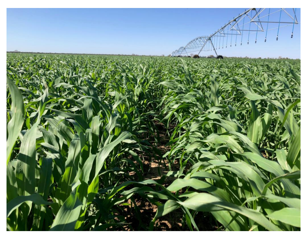
Figure 2 - Recently planted forage sorghum at Glenaras

Remarkable progress has been made with the Glenaras irrigation trial, with the centre pivot irrigation system now fully operational. This Pilot utilizes produced water without any treatment required due to the high quality of the water. The forage sorghum crop is growing rapidly as can be seen in Figure 2 below and will result in significant assistance to landholders for livestock management and is providing proof of concept for a scalable, low-cost solution for produced water at the Project.