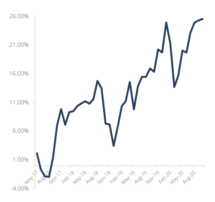
Past Performance is not an indication of future performance.

Sensata (ST) is a global leader in sensor technology and sensor-based solutions used in mission critical applications underpinned by megatrends such as vehicle electrification, smart and connected fleets, clean, efficient and autonomous vehicles. ST upgraded Q3 guidance in September however reported numbers exceeded this guide by quite a margin with EBIT of $155m well ahead of its $132-$142m guide. The business continues to grow faster than its underlying auto and heavy vehicle end markets which are under extreme pressure as demand for its emission, electrification and safety related sensor technology continues to provide increased content per vehicle.