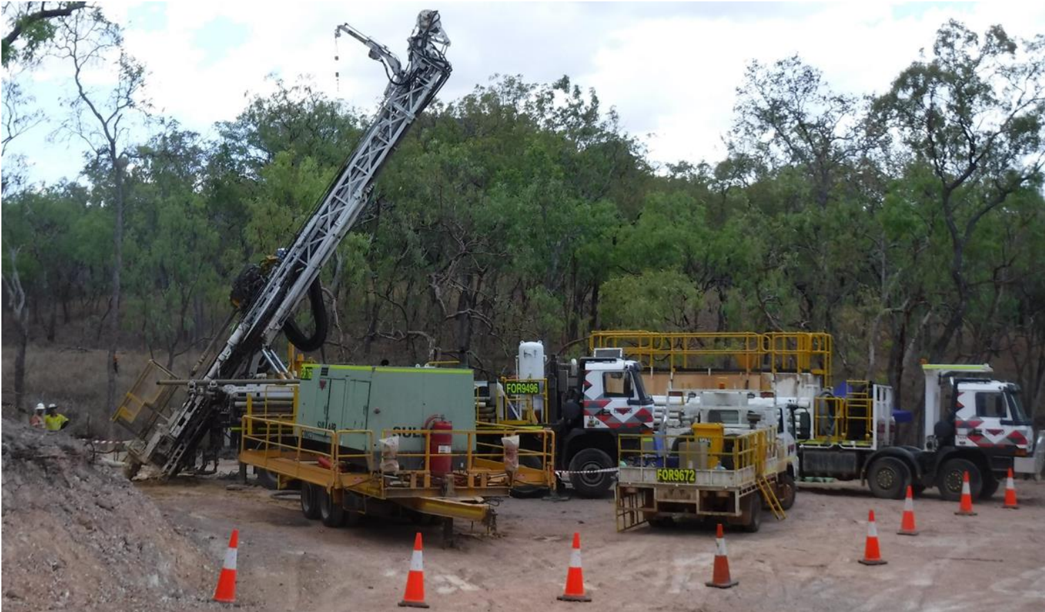
Figure 1: Drilling underway at Leane's Copper Prospect, November 2020