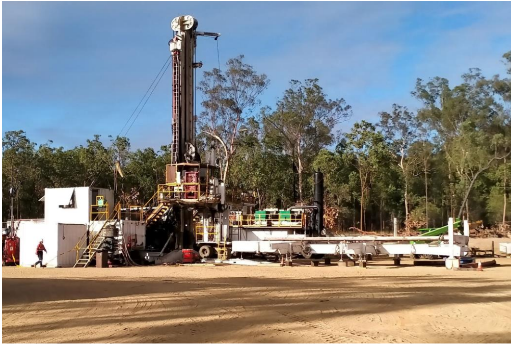
Figure 1: Silver City Drilling Rig 25 drilling Nyanda-7 at Reid's Dome