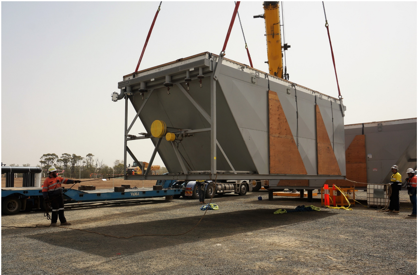
Procurement of long-lead items is underway for the expansion of Roma North to 24 TJ/day. This includes compressor modules such as the one pictured, which was delivered during construction of the existing facility.

Senex has previously secured the primary approvals required for this project, including environmental authorities to construct additional compression and wells, native title agreements and EPBC approval. Key activities underway include site selection for an additional gas processing facility, landholder discussions and wells and gathering design. Senex is also considering its approach to construction and ownership of the additional facilities, including another roll out of Senex's proven modular approach to facilities (supported by debt financing), or awarding a BOO contract to an infrastructure provider.