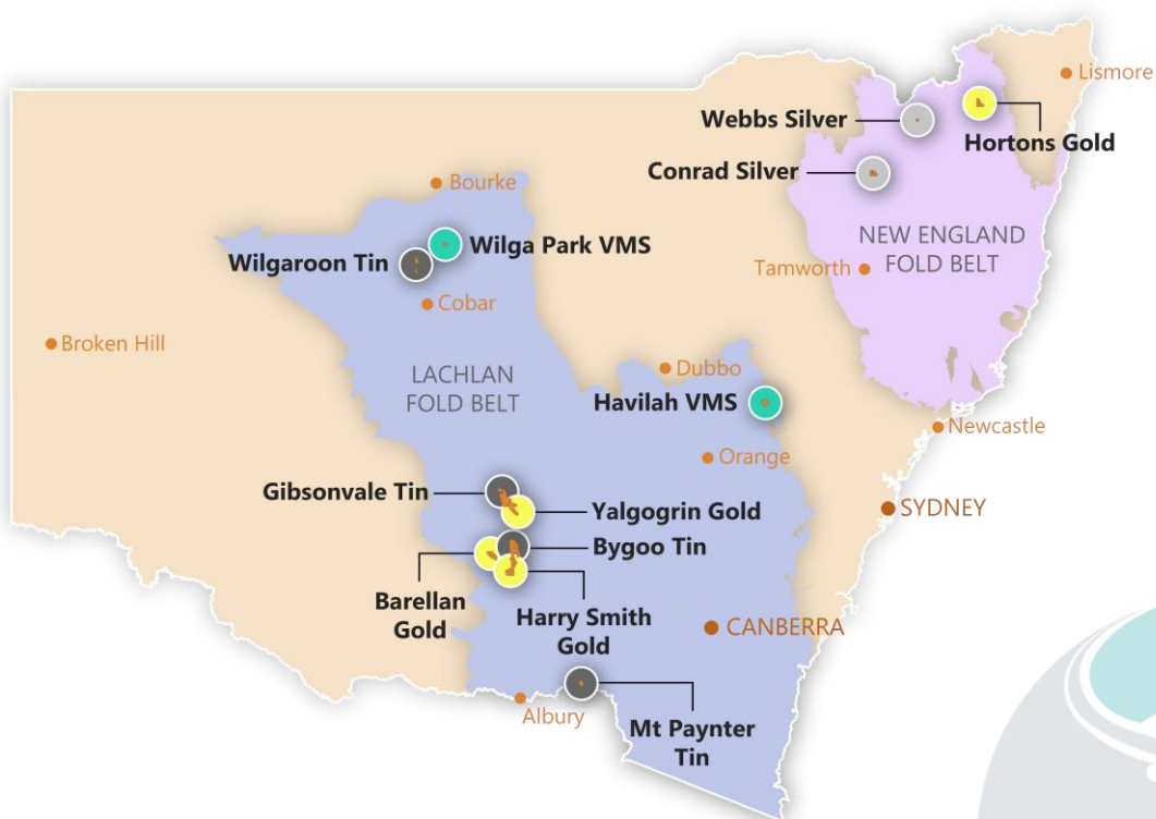
Figure B: Location of Thomson Resources Projects in NSW