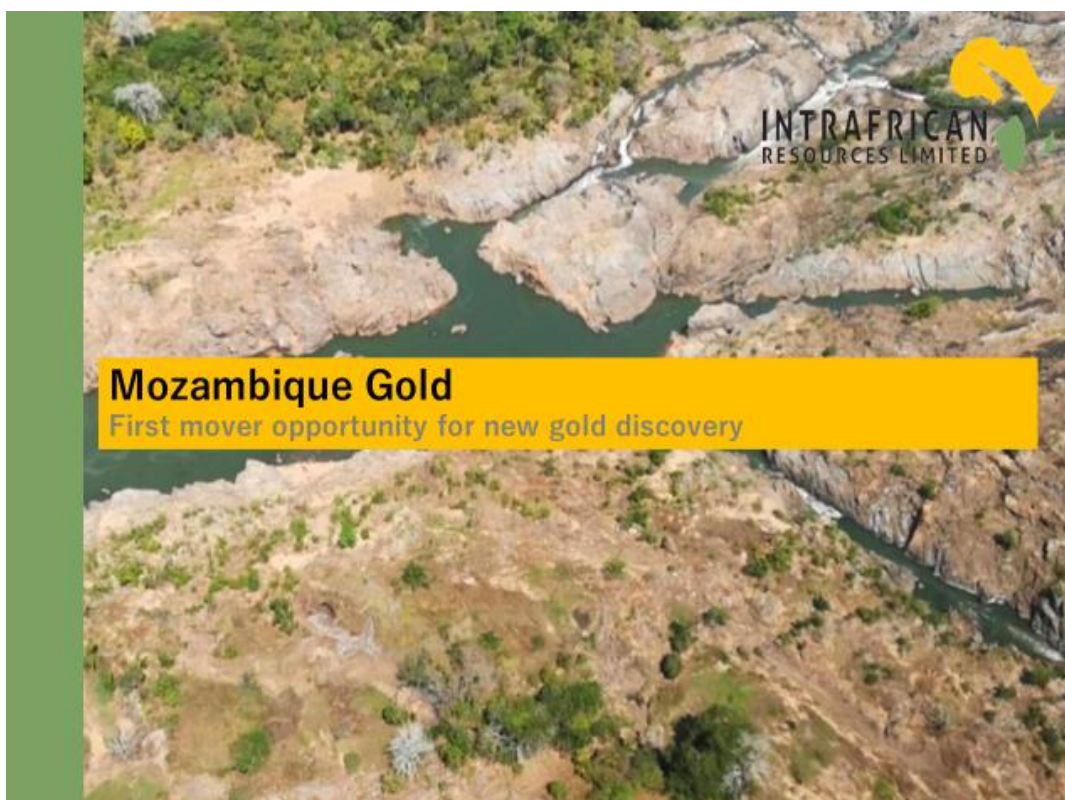
Photo of the potential 'Mutege' gold trap in the Lurio River subject to exploration and dredging