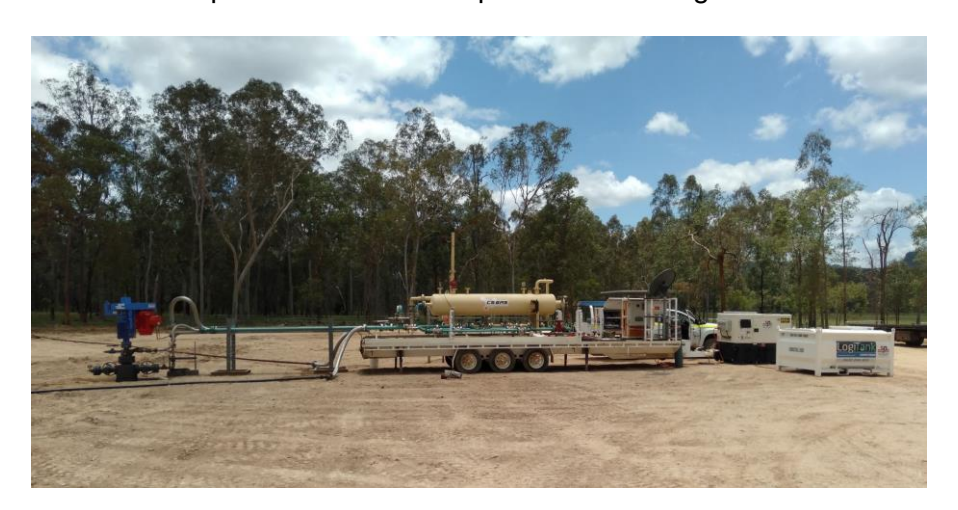
Production testing at the Nyanda-7 well, January 2021

State Gas will continue to update the market as production testing continues.