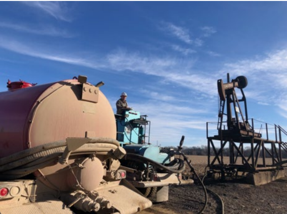
Images 2 & 3: Workover activity underway on Trey Exploration leases