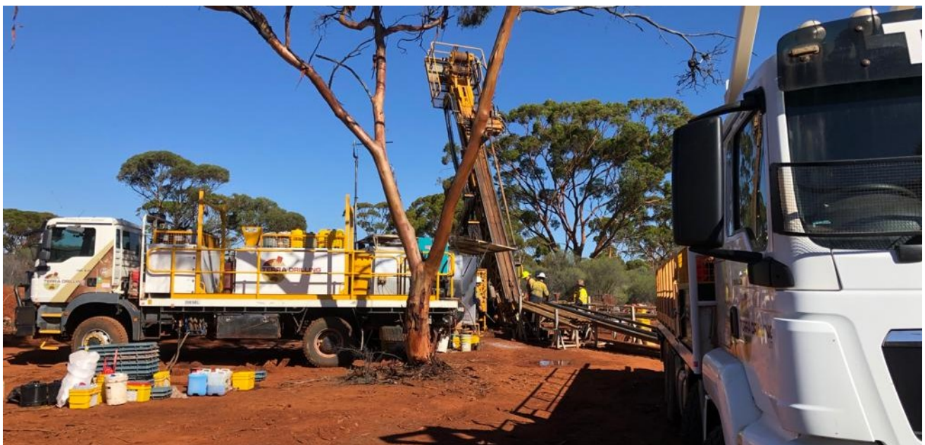
Figure 2. Photo of Terra Drilling - Diamond Drill rig #1 at Wattle Dam East nickel target.