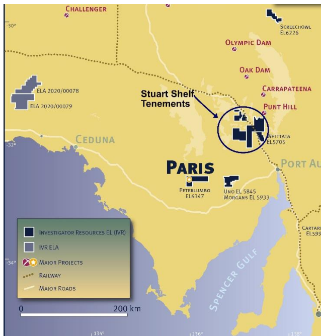
Figure 1: Investigator’s Stuart Shelf tenements

https://cdn-api.markitdigital.com/apiman-gateway/ASX/asx-research/1.0/file/2924-02344771-2A1282220?access_token=83ff96335c2d45a094df02a206a39ff4