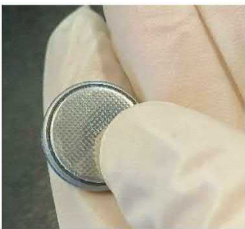
Figure 1: Novonix – Freshly assembled lithium-ion battery coin half-cell with Lake's lithium product