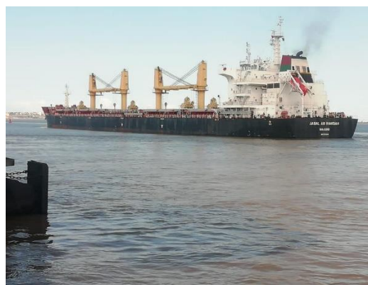
Image: ship leaving TCM Matola Terminal, Maputo Port, Mozambique following completion of loading.

This announcement has been approved by the Company's Disclosure Committee for release.