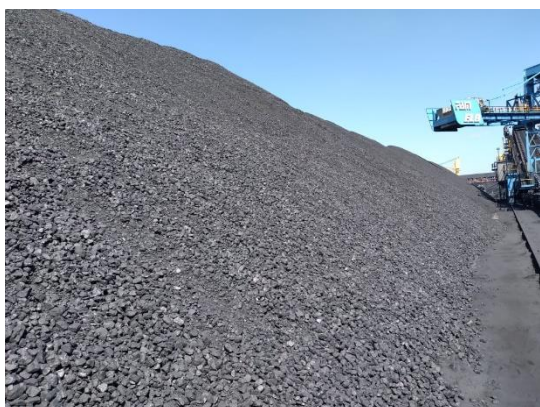
Image: Coal stockpile prior to loading at TCM Matola Terminal, Maputo Port, Mozambique.

"The implementation of the export strategy in South Africa has been a key focus of the Company's commercial and marketing team since the Company acquired Universal Coal plc in June 2020. The coal quality from several of the South African operations is high and the now established export strategy provides the platform for further growth opportunities for the Company in this market. We look forward to working with the South African management team to increase our export sales mix to deliver on the total coal sales targets."