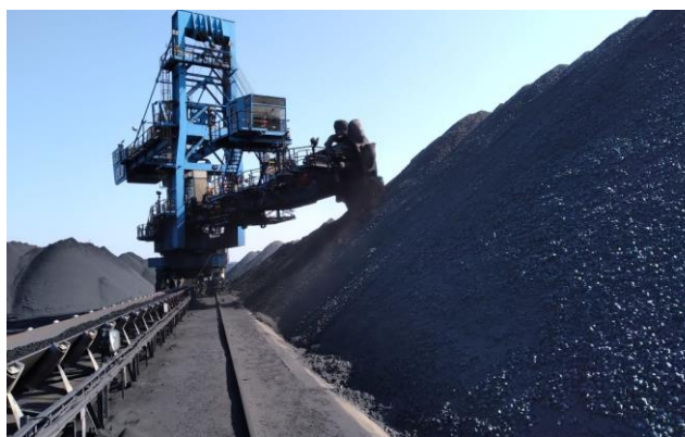
Image: reclaimer taking coal for loading on the ship.