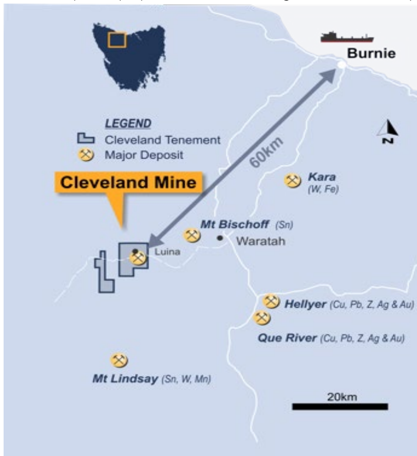
Figure 2. Cleveland Project Location

Work continues at Cleveland on identification of additional exploration targets and an official submission of the new development proposal for the mine design of a combined open cut/tailings retreatment project.