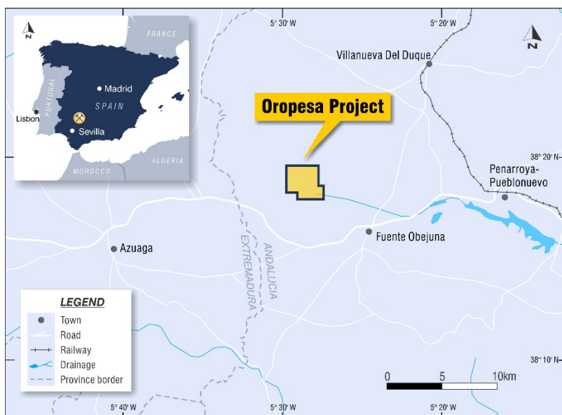
Figure 1. Oropesa Tin Project Location