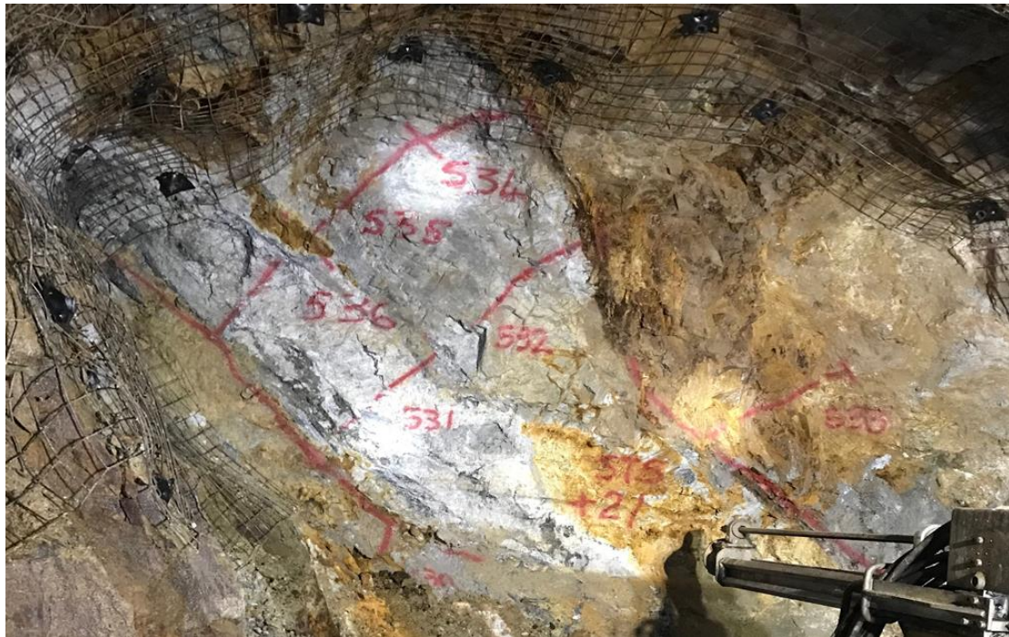
Image 1. 2150 vein above the old workings showing masses of quartz surrounded by altered wall rock which is typical for this structure.

Project reports completed by Harold Baxter, an Engineer of Mines, in 1909 and by Atlas Precious Metals Limited in 1984, determined that approximately 40% of the vein system is mineralised as measured by the length of linear feet of drifting vs stoped out area. Both of these reports are not JORC compliant.