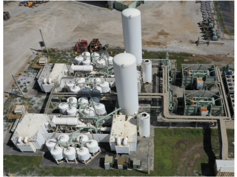
Las Lagunas Oxygen Plant