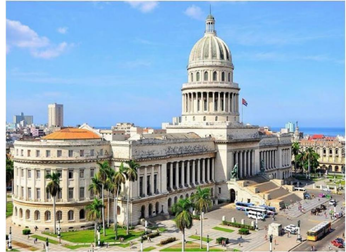
Capitol Building, Havana