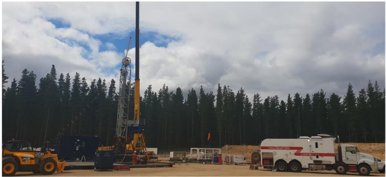
Figure 1: Superior Energy rig at the Nangwarry-1 site

Uses for food grade CO<sub>2</sub> include refrigeration/dry ice (needed for storage of some vaccines), carbonation for soft drinks and beer, firefighting, medical devices and winemaking.