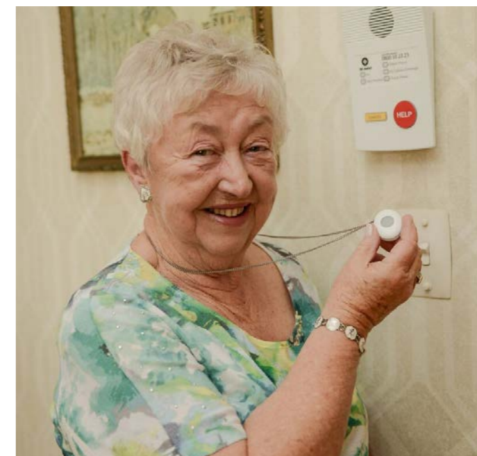
The latest medical alarms connect directly to St John

This is a great example of what IoT is all about - empowering better decision making, balancing technology with human interaction and delivering tangible and meaningful ways to run more efficient operations.