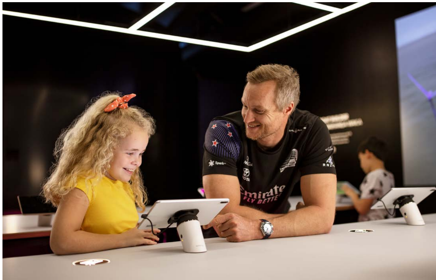
Spark's 5G Race Zone: An immersive insider experience for the fans