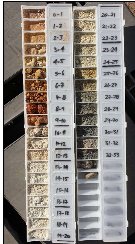
Figure 2: OAR's Gibraltar Project Drill cutting from GBAC069 showing good white kaolinitic saprolite developed over gneissic basement material.

Composite samples from the early stages of the drilling have been dispatched to the laboratory for detailed test work, with results anticipated to be returned from May 2021.