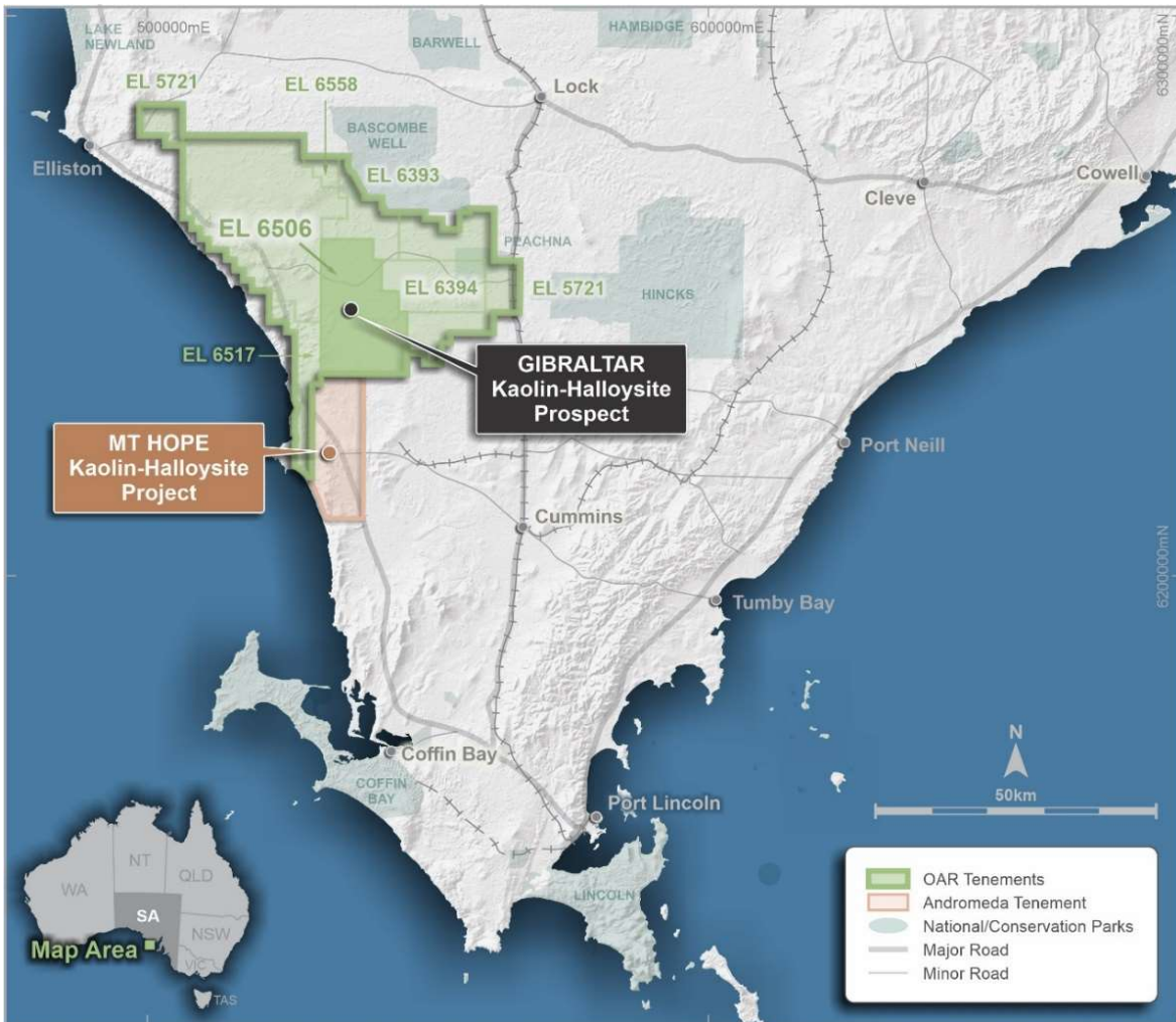
Figure 4: OAR's Gibraltar Project – Project Location plan