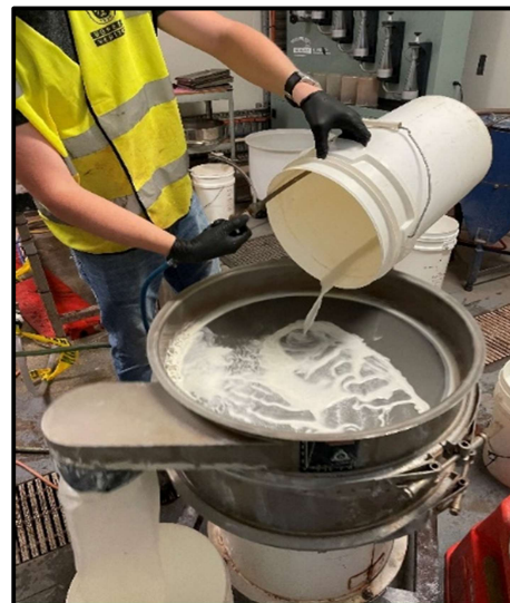
Figure 3: Wet sample screening for size fraction analysis of white kaolinitic saprolite clays from the Gibraltar Project South Australia.