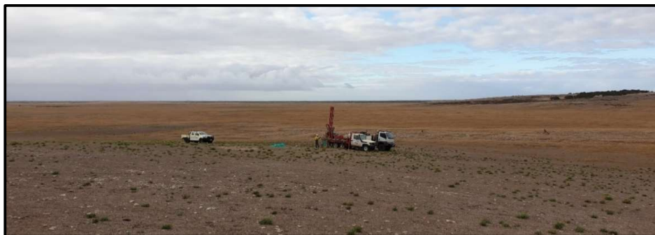
Figure 1: OAR’s Gibraltar Project – AC Drilling rig completing 400m x 400m wide-spaced drill pattern

Oar Resources Limited (ASX: OAR) (“OAR” or “the Company”) is pleased to advise that its latest phase of extension air-core drilling has been completed at the Company’s Gibraltar Halloysite-Kaolin Project (“Gibraltar” or “The Project”) in the Eyre Peninsula, in South Australia. The Project is located to the north and adjacent to the Andromeda Metals Ltd (ASX: ADN) (“Andromeda”) Mt Hope Kaolin-Halloysite Project ( Appendix 1 ).