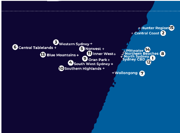
NSW Existing Locations: 15