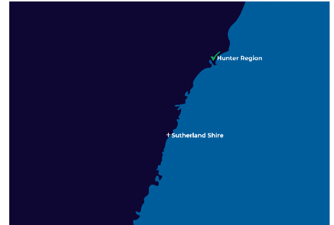
NSW Target Marquee Locations: 2