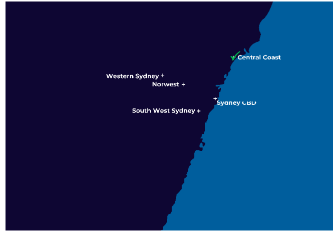
NSW Target Tuck-in Locations: 5