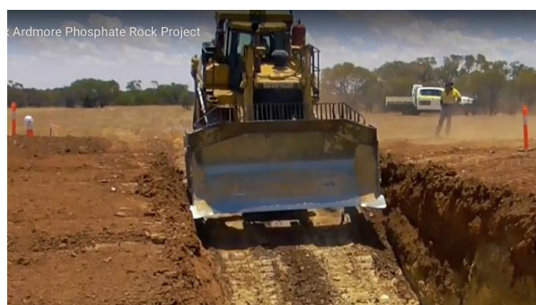
Dozer operation at Ardmore

Centrex continues to progress towards revision of its DFS on the Ardmore Phosphate Project to reflect current circumstances and financial parameters.