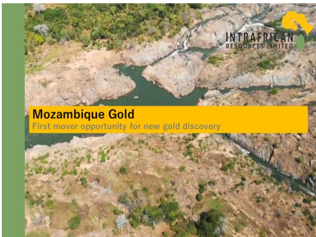
Photo of the potential 'Muteger' gold trap in the Lurio River subject to exploration and dredging