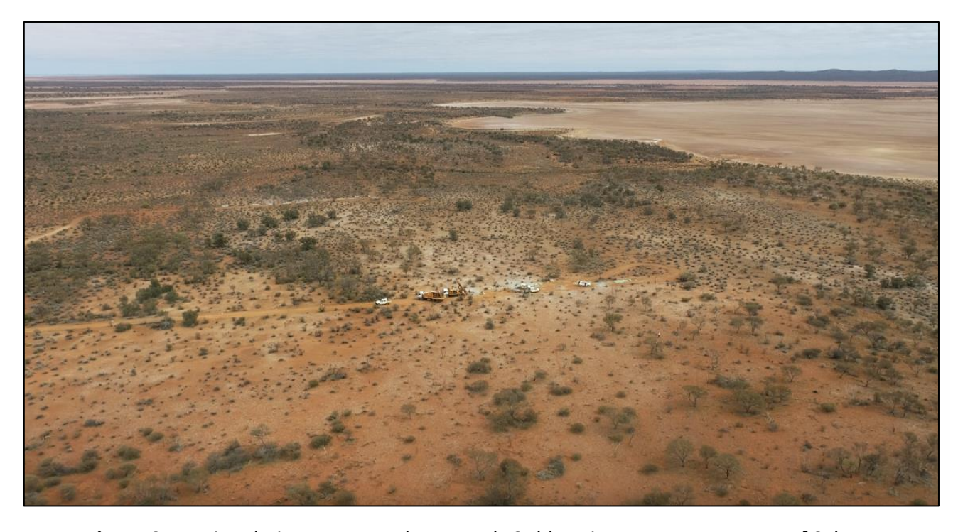
Figure 2 - Regional View over Porphyry North Gold Project