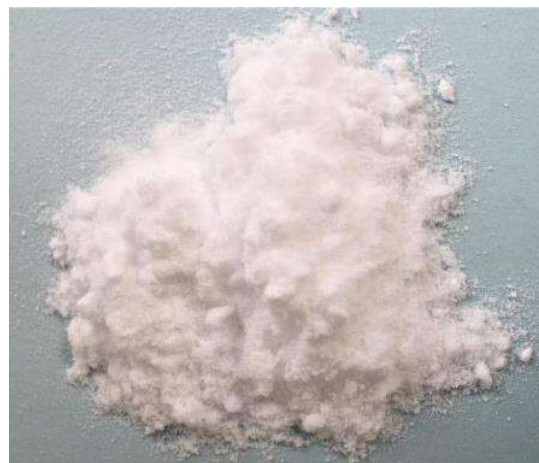
Figure 3: Novonix – Freshly assembled lithium-ion battery coin half-cell with Lake’s lithium product: Hazen Research – Production of Lake’s lithium carbonate product in lab in Colorado, USA..

Export credit offers a low cost and secure form of debt funding which will maximise value for shareholders and minimise risks to the Company.