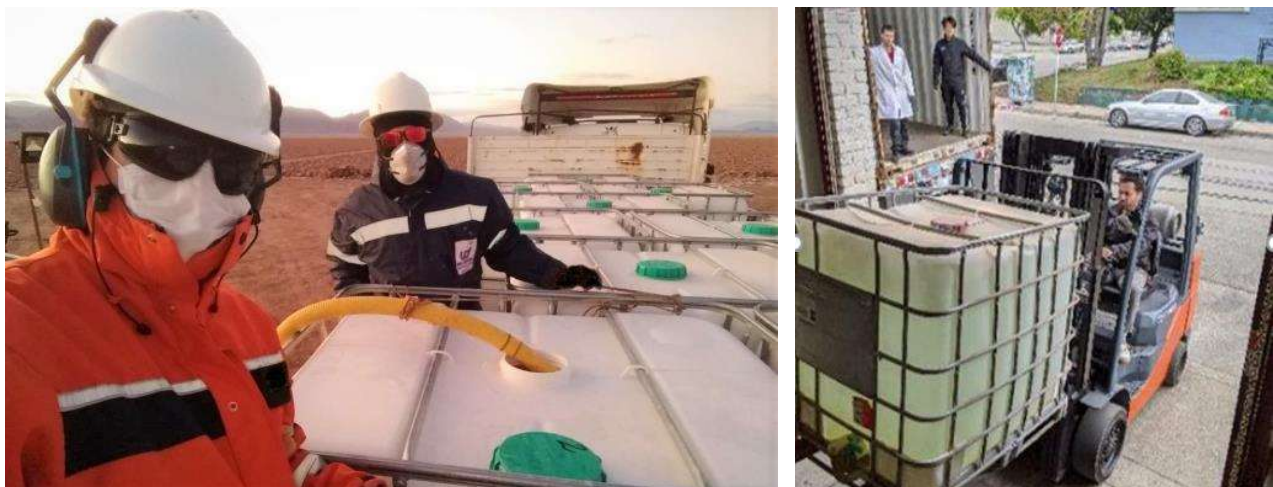
Figure 2: Lithium brines being pumped into containers at the Kachi Project. Containers delivered to Lilac in California.

An energy optimisation study is reviewing a solar hybrid power alternative which is expected to lower the operating costs and also lower the carbon footprint.