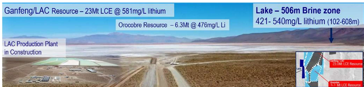
Figure 4: Cauchari – Location of Lake's Cauchari results in relation to the Ganfeng/ Lithium America's production development

This drilling confirmed similar grades and lithium brines extending into Lake's properties from the adjoining Ganfeng/Lithium Americas JV production development at Cauchari. The higher-grade results averaged 493 mg/L lithium over 343m (from 117m to 460m), up to 540 mg/L, with a Li/Mg ratio of 2.9.