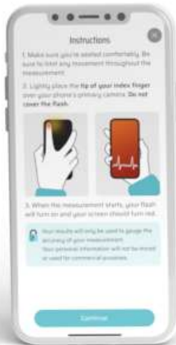
Discrete HRV: Measure