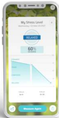
Discrete HRV: Results