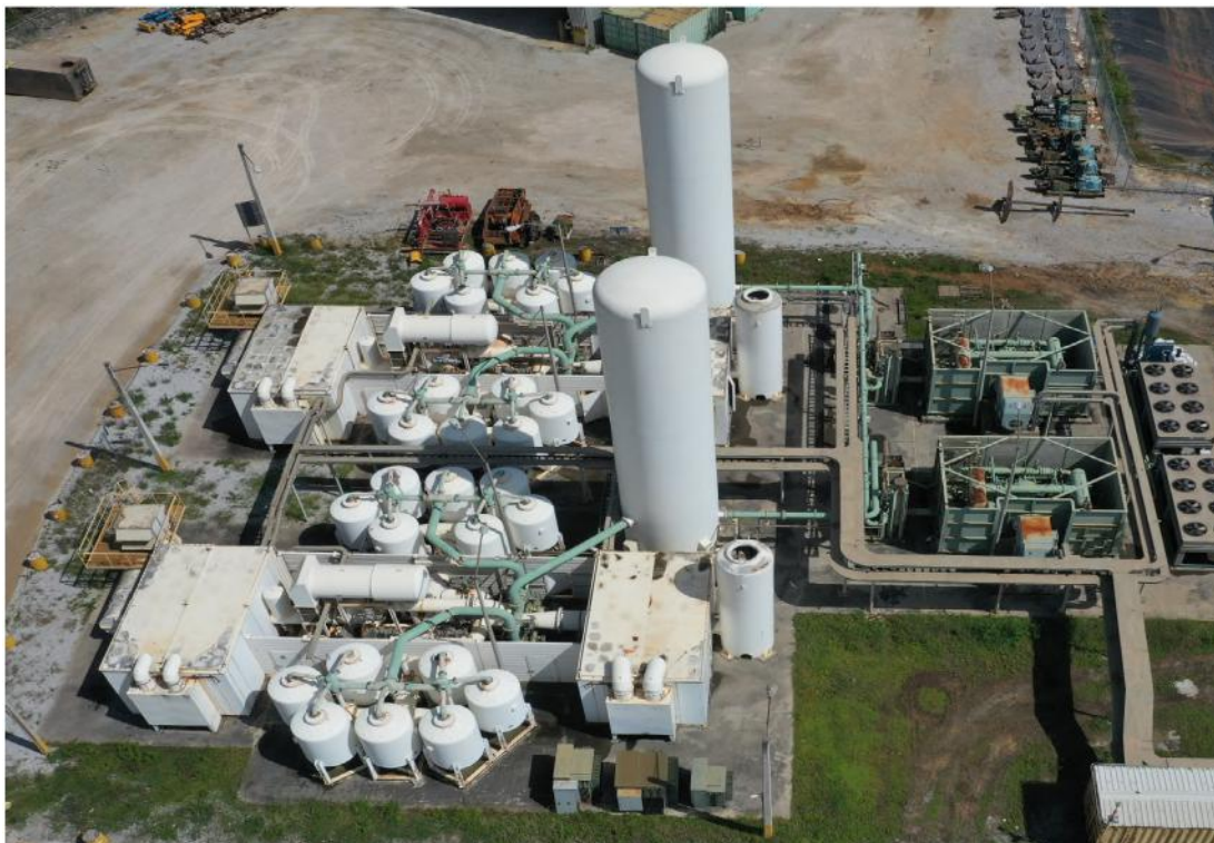
Las Lagunas Oxygen Plant

The Company has commenced negotiations with an Australian engineering group for them to provide a turnkey design and construction proposal to build such a plant, with the proposal expected in Q4 2021. This will allow Antilles Gold to determine if this development option is worth pursuing.