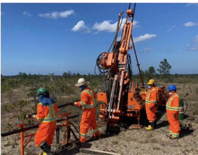
Drilling – La Demajagua