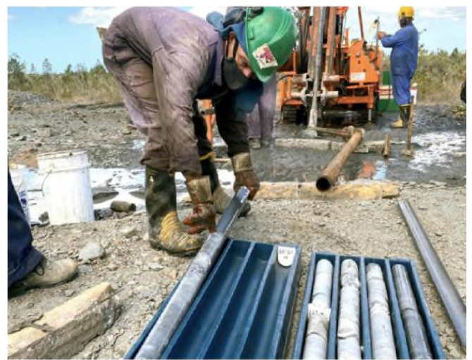
Core Tray – La Demajagua