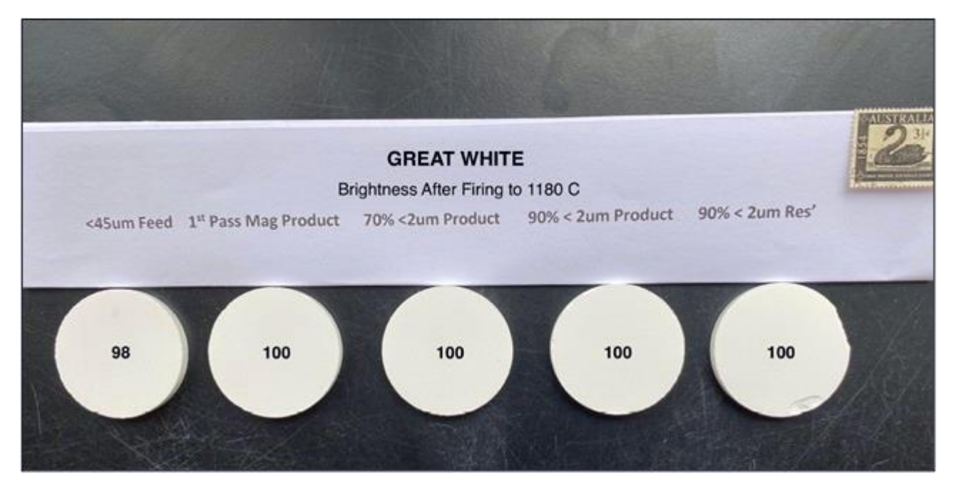
Figure 2 - Fired brightness discs from ceramic testing completed recently

Significantly, all processed samples were close to the theoretical maximum for aluminium oxide for kaolinite (39.5%Al<sub>2</sub>O<sub>3</sub>) and with virtually no colouring oxides or alkalis which indicates good potential to produce High Purity Alumina (HPA). The Great White halloysite-kaolin has already proven to be a premium feed for HPA