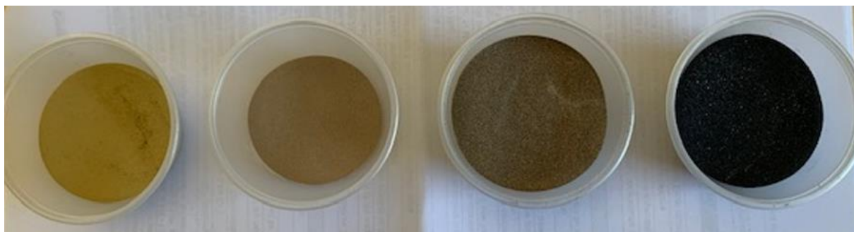
Figure 1. Astron's final product samples (REEC, zircon, non-magnetic concentrate, magnetic concentrate respectively)