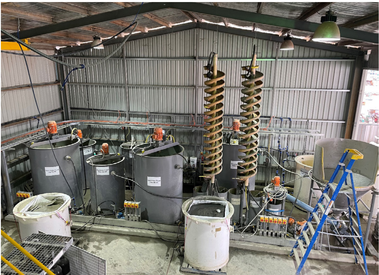
Figure 1 – Broken Hill Cobalt Project – Concentrate Circuit

COB is pleased to provide the following photographs of key unit operations