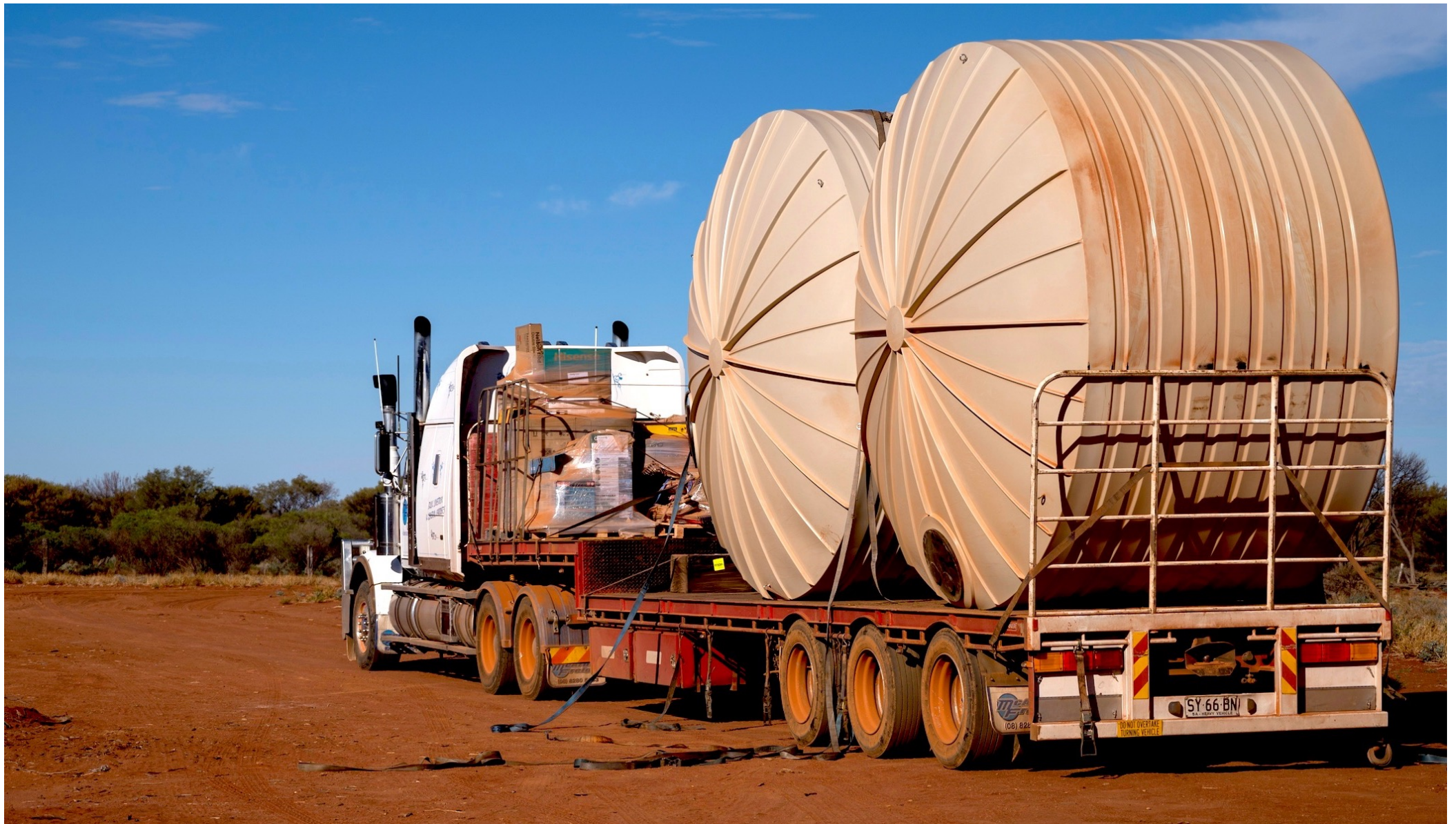
Figure 4: New water tanks arriving at Aurora Tank camp