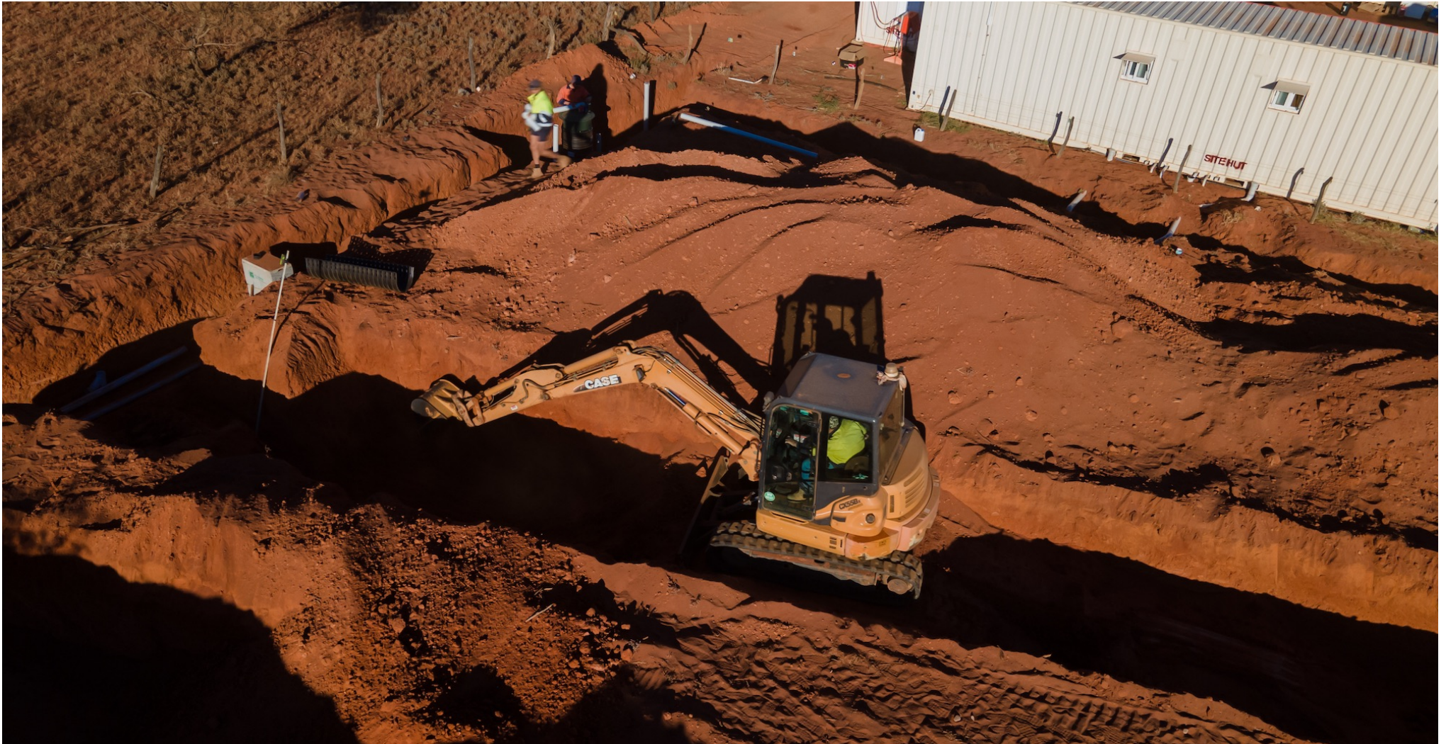
Figure 2: Work in progress for new waste water treatment system