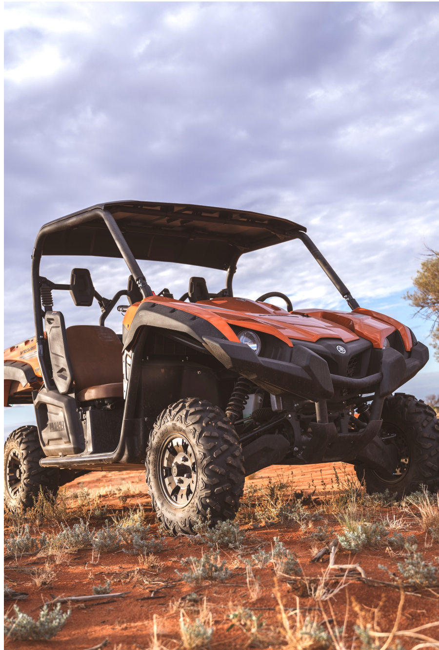
Figure 3: New 'Jaffa bug' at Aurora Tank – latest addition to Marmota's ATV fleet. It has worked superbly for the Phase 2 ADI biogeochemical sampling just completed.