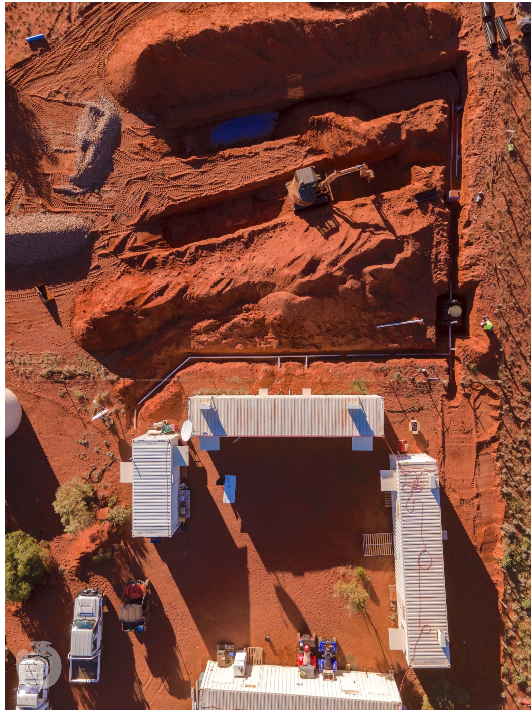
Figure 1: Aerial view of new infrastructure works at Aurora Tank camp