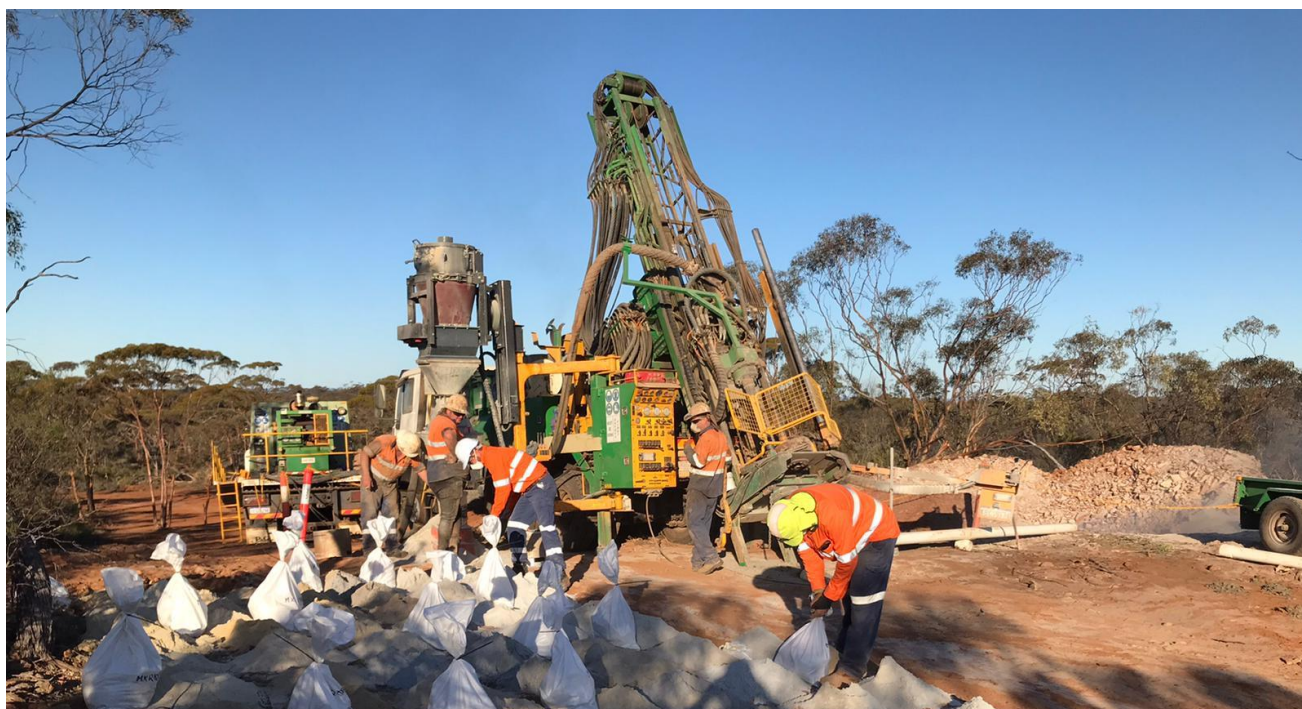
Figure 1 - Kennedy Drilling - Rig 4 at Yilmia gold target

Maximus Resources Limited ('Maximus' or the 'Company', ASX:MXR) is pleased to advise the start of the multi-target ~4,000-metre Reverse Circulation (RC) drilling programme targeting several near-mine and regional exploration gold targets across Maximus' Spargoville tenements, located 24km from Kambalda, Western Australia's premier gold and nickel mining district.