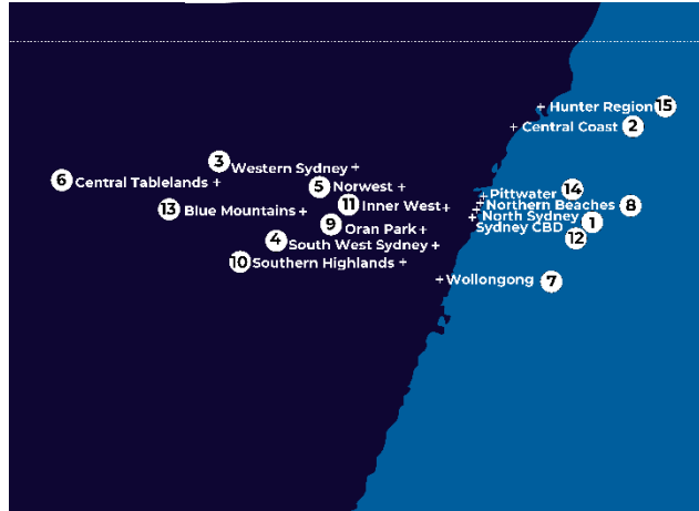
NSW Existing Locations: 15