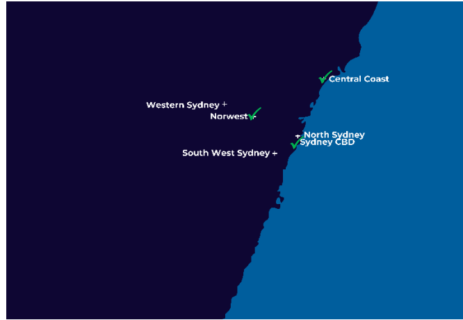
NSW Target Tuck-in Locations: 6 (completed: 3)