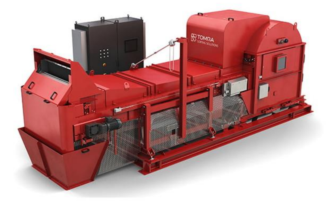
Figure 2: Typical TOMRA ore sorting equipment