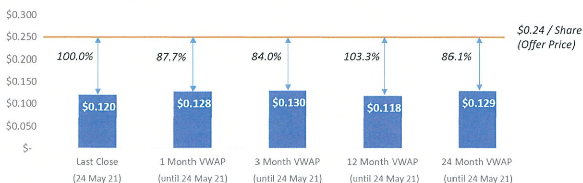
Figure 1: Offer premium