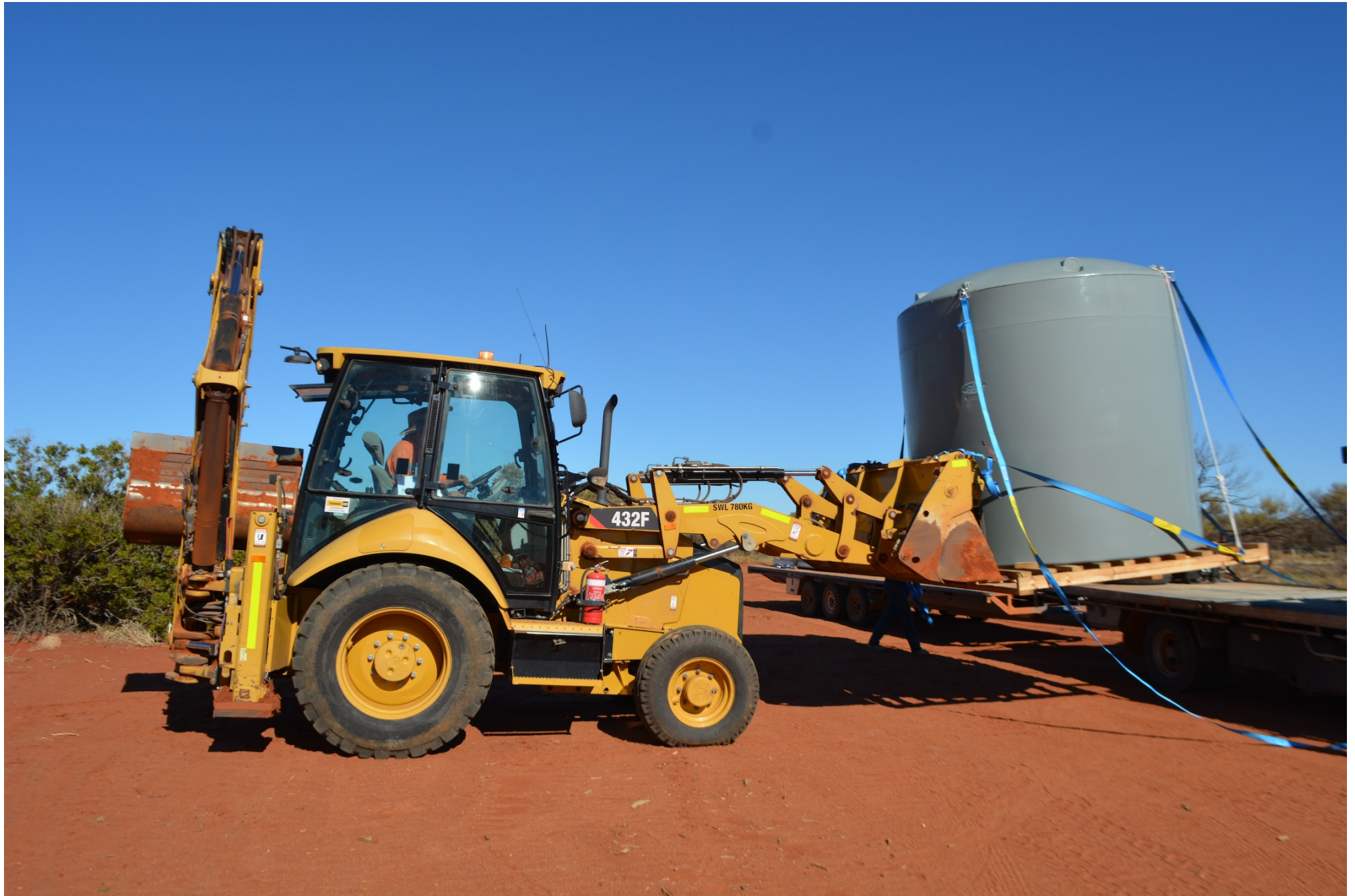
Figure 1: Arrival of new self-bunded 10,000L diesel tank yesterday