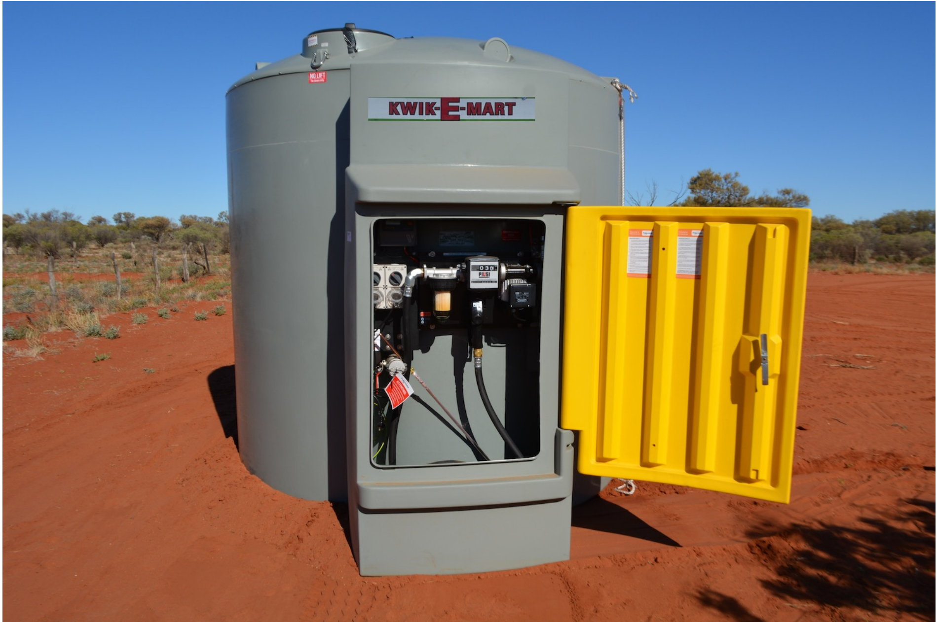
Figure 2: Our new drive-up fuel tank facility