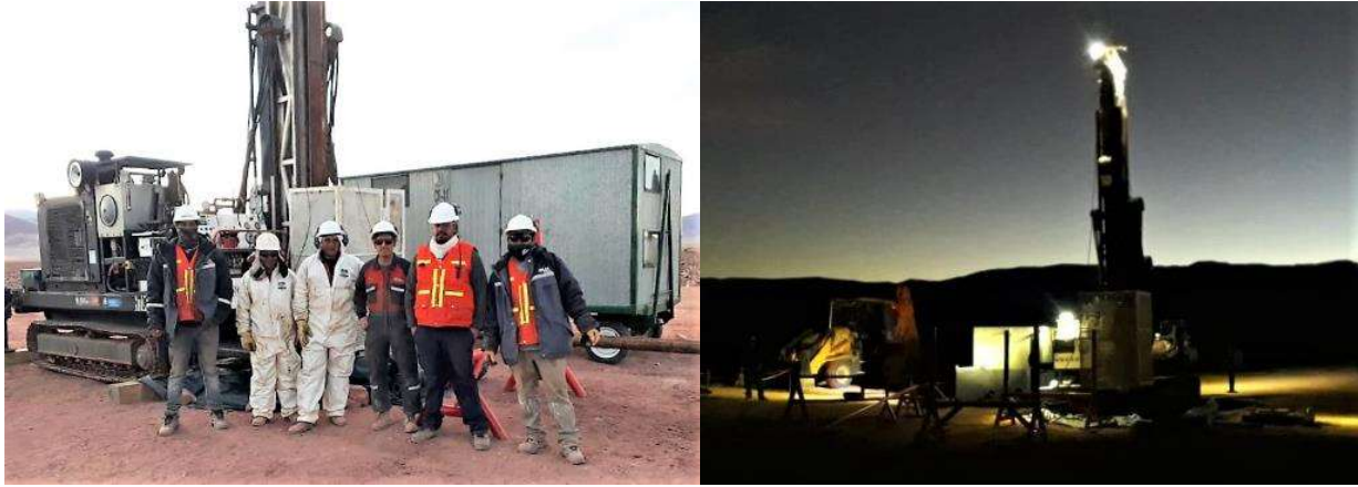
Figure 3. Drill rig operating at Kachi Project