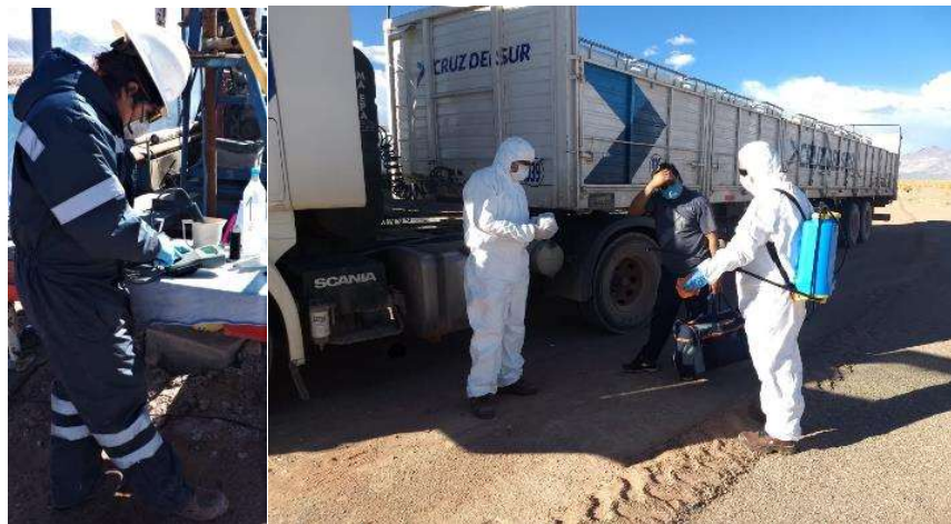
Figure 4. Drill rig operating at Kachi Project; COVID-19 controls.