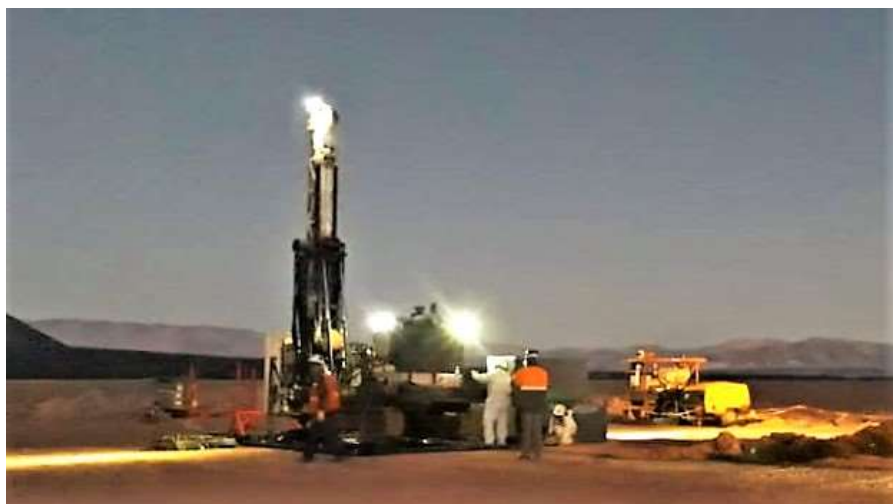
Figure 2. Drill rig operating at Kachi Project